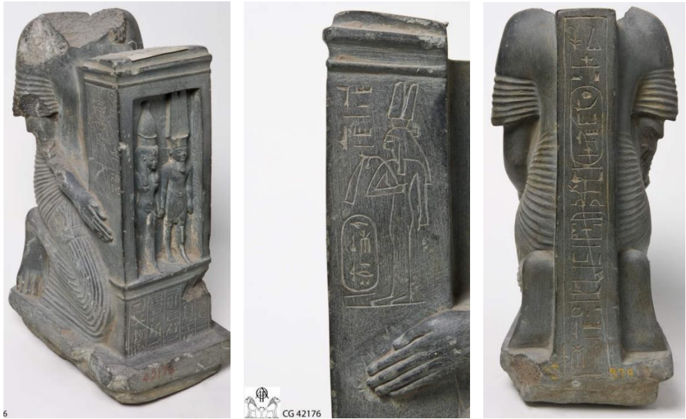
Fig. 12 Naophorous Kneeling Statue of Amon ms with Amon and Mut https://www.ifao.egnet.net/bases/cachette/ck340

(The hereditary prince and the mayor, the first prophet of Amon Backenkonsu, justified). 25