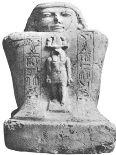
Fig.17. Statue of Amon mes with the figure of God Sobek Re photo

Catalogue du Musee du caire, statues et Statuettes pl.XXXIII.