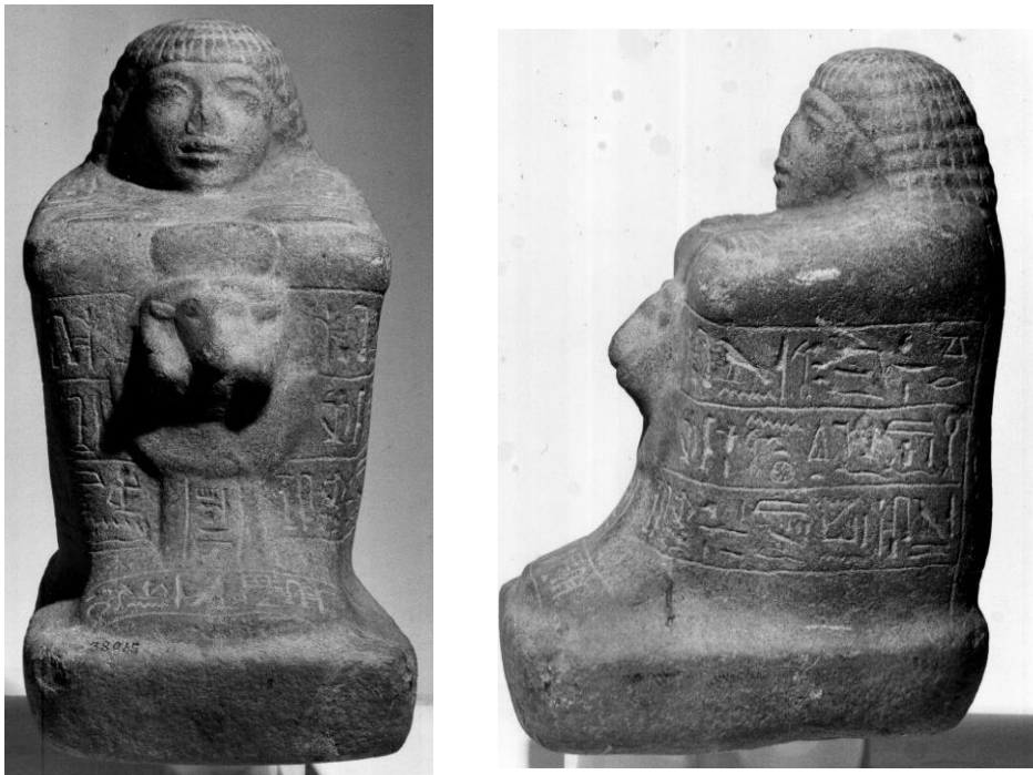
Fig.6 Statue of royal Scribe ḥry n w3st holding Ram-headed Standard https://www.ifao.egnet.net/bases/cachette/ck586

The Statue represents the royal Scribe during the reign of king Ramesses II, ḥry n w3st, squatting and sitting on the ground in the form of block, he wears a cloak which is enveloped his body and covered all his details, only his hands appear from the cloak, he is wearing a shoulder-length wig that hanging down to the shoulder level, leaving his ears exposed the Ram-head decorated the front of the statue, upon the Ram head solar disc and the head framed below by a broad collar.