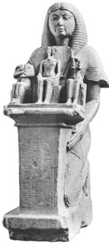
Fig. 10 Kneeling Statue of Qen Amon holding the holly tirade of Thebes https://www.ifao.egnet.net/bases/cachette/ck565