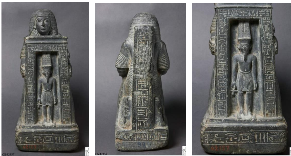
Fig.2 The Naphorous Statue of M3a Hwyt https://www.ifao.egnet.net/bases/cachette/ck250

(To the ka of first prophet of Amon M3 c ḥwy, to the ka of the hereditary prince and the mayor, the royal scribe beloved of him, the overseer of all the priests of the gods in the south and the north M3a Hwy, the first prophet, the great praise, scribe of the offering, overseer of Granaries of the god Amon the first prophet M3 c - ḥwy).