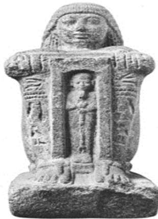
Fig.18 Nubian Block statue of Wen nefer with figure of Ptah https://www.ifao.egnet.net/bases/cachette/ck16

The Nubian Block statue represents Wen Nefer the chief royal scribe during the reign of Ramesses II 42 , squatting in the form of block and sitting on the ground with arms crossed upon his knees, he is wearing a cloak that enveloped all the details of his body, only his hands are shown uncovered on the knees, he is wearing a double shoulder length wig, reach to his shoulder, small bart attached to his chin, the lower edge of the dress is defined at ankles, sandals wear on the feet which their festinating thongs in high relief, in between his legs the small statue of the god Ptah which is standing in the naos.