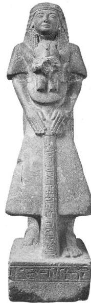
Fig.11 Statue of Bakenkhonsu as Standard bearer https://www.ifao.egnet.net/bases/cachette/#galerie

The Statue represents the royal Scribe Qen Amon during 20 th dynasty, he is kneeling and holding an altar with carried three small statue of the holly tirade of Thebes, the heads of the three statues of the holly triade are missing and destroyed, Qen Amon wears a long pleated costume reach to his ankles with wide sleeves, he is wearing a shoulder length curly wig that reach to back of his shoulder, the altar inscribed with formula to the god Amon, the left row of the vertical inscriptions the offering formula dedicated to their son the god Khonsu, the text of inscriptions are following: