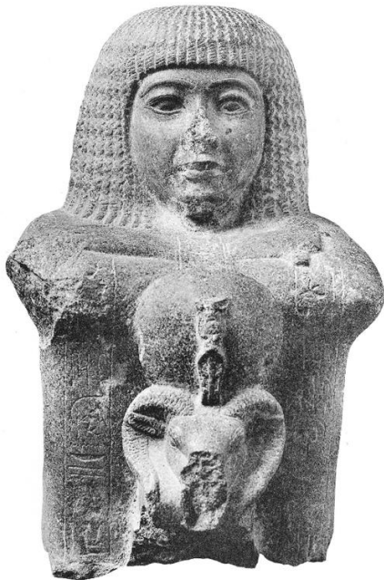
Fig.7 Block Statue of Swty holding Ram-headed

(An offering which the king gives to god Amon-re lord the thrones of the two lands, the fan bearer (to the right of the king) royal scribe, overseer of the two lands.... justified the fan bearer the right side of the king, the royal scribe, overseer of treasury of the two lands.....justified).