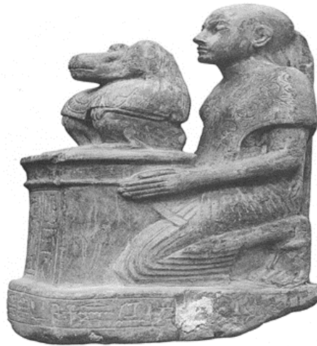
Fig.18: Kneeling Statue of Ipy holding Cynocephalus on a base

https://www.ifao.egnet.net/bases/cachette/ck220