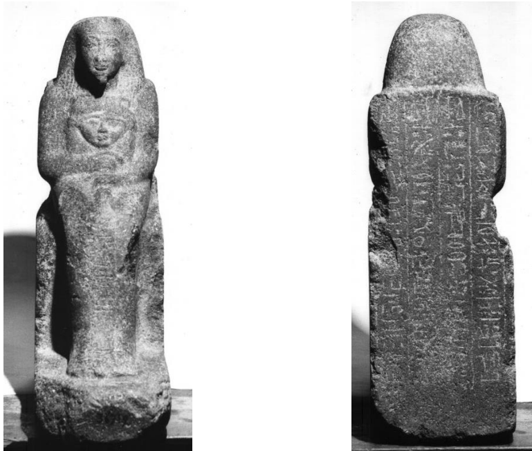
Fig. 14 Sistropher Statue of Nakht Wsr holding Sistrum Kristen, Konrad " Sistrophor oder Sistrumspieler ? Zur Deutung privater Tempelstatuen mit kleinem Sistrum", BSEG 29, (2011-13),57.

The seated sistropher Statuerepresents Nakhtwsr(hrj s3w wsr(?)) 35 the chief of guardian, sitting and holding to his chest hatoric elements a sistrum of the Goddess Hathor which was hidden completely his torso, he is wearing a long garment, double shoulder length wig, reach under his shoulder, the chair was decorated each side by figures of his sons and daughters, the back pillar of the statue were inscribed with the formula of ḥtp di nswt for the goddess Mut the lady of Isheru that has the relation with the place of discovery in Karnak as the cult center of the holy triad of Thebes and the offering formula of ḥtp di nswt to the holy tirade of Karnak Amon, Mut, and Khonsu