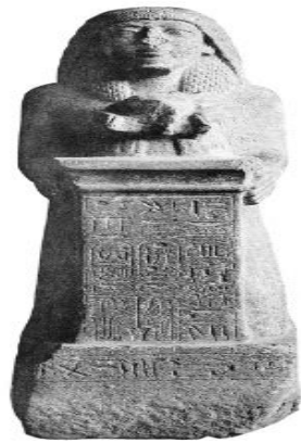
Fig.4 Kneeling Statue of Vizier Paser with Ram head

https://www.ifao.egnet.net/bases/cachette/ck30