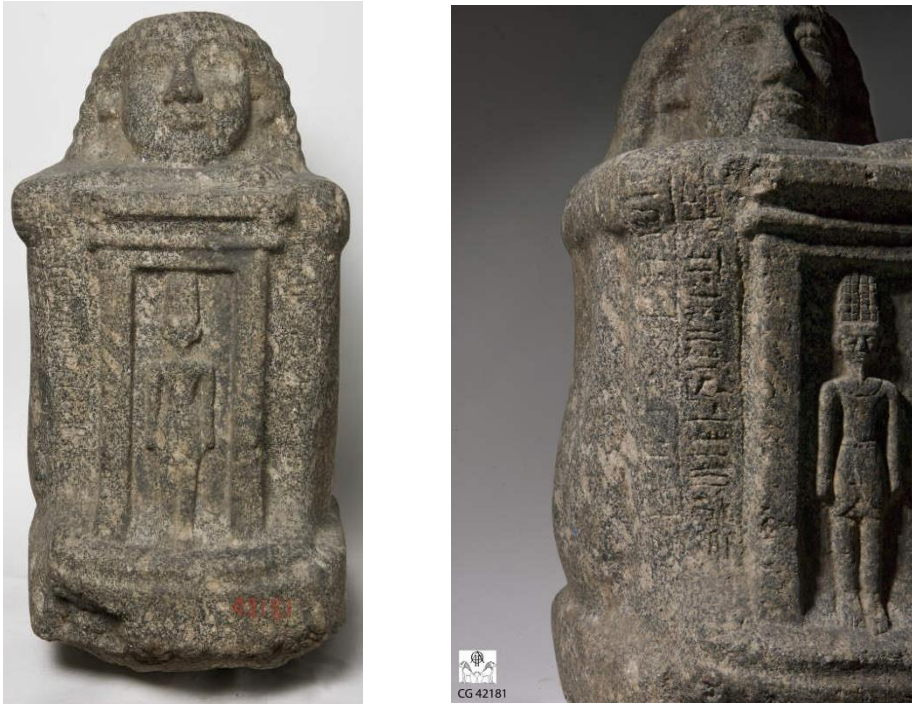
Fig.9 Naophorous Block Statue of wsr-H3t with Amon https://www.ifao.egnet.net/bases/cachette/ck48

The Naophorous block Statue represents Weser hat, the first prophet of Montu, the lord of Thebes squatting and sitting on the ground in the form of block, his body enveloped on long mantel which covered the details of the body, only his hand appear from the mantel, he is wearing a shoulder length wig, the wig hanging down to shoulder level, leaving his ears exposed, the front of the statue the naos decorated with the Statue of the god Amon.