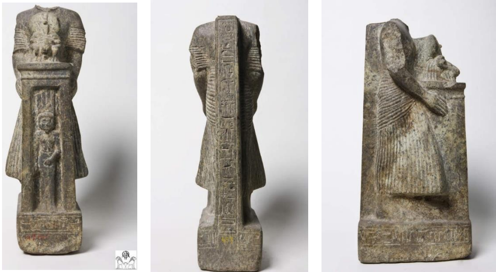
Fig. 16. Naophorous Statue of Bakenkhonsu with figure of the god Anhure and Ram headed

https://www.ifao.egnet.net/bases/cachette/ck417