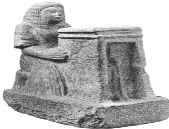
Fig.13 Naophorous Kneeling Statue of Amon ms with Figure of Amon

https://www.ifao.egnet.net/bases/cachette/ck129