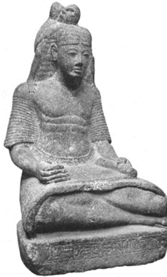
Fig.20 Statue of Ramesses Nakht as Scribe donated by his Son Nesamun Catalogue du Musee du caire, statues et statuettes pl.XXVI.

The Statue represents Ramesses Nakht, the high priest of Amon during the reign of Ramesses IV to the reign of Ramesses XI, he is in squatting position as scribe, he is seating with a traditional pose of the scribe with open roll of papyrus upon his leg, he is bowing his head towards the papyrus as if he is writing, he is having folds of fats in his body, which refer to youth and prosperity, and spent his life reading and writing, he is wearing short pleated kilt with wide sleeves, his short kilt covered his body, only his arms and legs appear,he wears a short shoulder wavy wig, the waves radiates from the top of the head, the wig leaves his eare exposed, the baboons is embracing his head as representations of the god Thoth symbol of wisdom and protections.