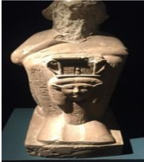
Fig. 15 Amenemhat as a Beggar

in Luxor Museum 5/2/2019