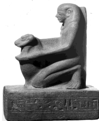
Fig.5 Kneeling Statue of ThauNefer holding Ram head Vase

https://www.ifao.egnet.net/bases/cachette/ck396