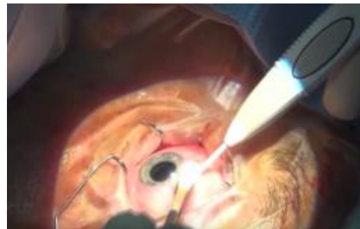
Figure (1): Intravitreal dexamethasone implant (Ozurdex ® )

All patients in group 2 implant dexamethasone, all implants were performed under sterile conditions, after preparation of the conjunctiva using 5% povidone-iodine solution, topical anesthetic with ropivacaine, and positioning of the blepharostat. A 700 \mu\text{g} slow-release intravitreal dexamethasone implant (Ozurdex ® ) (Figure 1) was placed in the vitreal cavity, behind the crystalline lens within 3 \pm 2 days from baseline examination. All injections were performed in an operating room. The dexamethasone implant was inserted into the vitreous cavity through the pars plana using a customized, single-use 22-gauge applicator. Patients were treated with a topical ophthalmic antibiotic (netilmicinsulphate) for seven days after treatment.