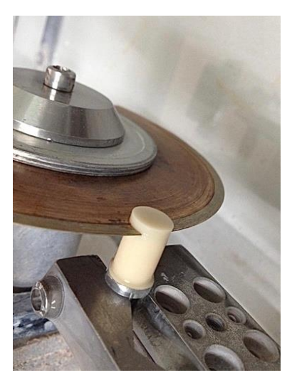
Figure (1): Cutting ceramic discs using Isomet 4000 Linear precision saw machine.

2mm using electric diamond cutting saw (IsoMet 4000 Linear Precision Saw, Buehler, USA) under constant water coolant ( Figure 1).<sup>27</sup> Dimensions of samples were verified using digital caliber (INSIZE digital caliber, Insize measuring tool, India).