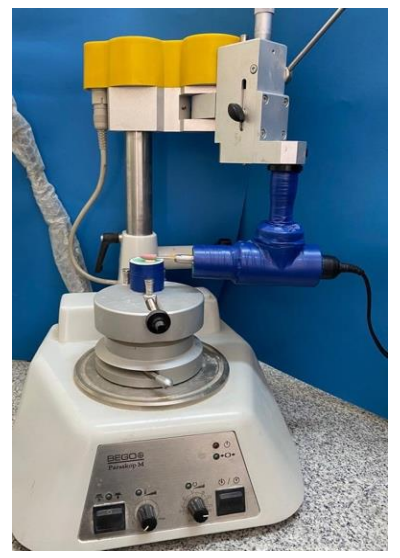
Figure (2): Parallellometer used for polishing procedure holding the mold containing ceramic sample and T-shape attachment with low-speed handpiece fixed inside it.

As polishing is a critical step, Tetric CAD and Vita Enamic samples were polished in a standardized manner. PVC tubes were used to construct a mold "holder" containing self-cure acrylic resin to hold ceramic sample, and a T-Shape attachment to hold the low-speed hand piece.<sup>30</sup> A parallellometer (BEGO Paroskop M, USA) was used for polishing procedure. A holder containing embedded sample was fixed on the horizontal table of the paralellometer while the T-shape attachment holding the low-speed handpiece was fixed to its vertical arm to be parallel to the holder containing the disc sample ( Figure 2 ).