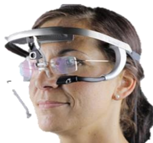
Figure 1: Eye tracking device