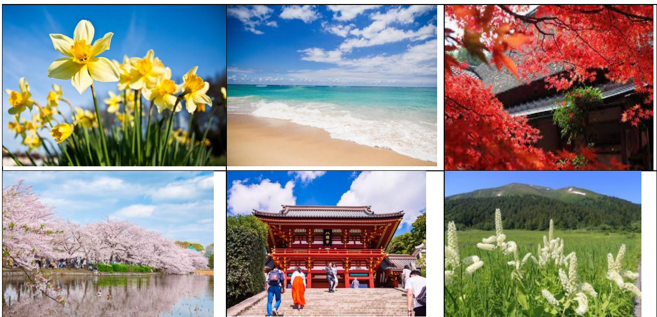
Table 1: The Neuromarketing Destination Stimuli