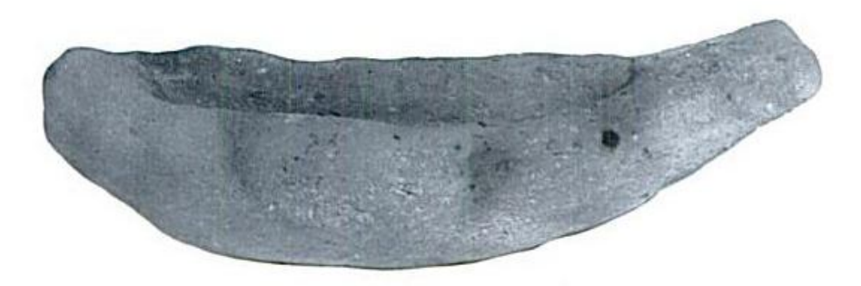
(Fig.2)Badarian boat model, (Petrie Museum of Egyptian Archaeology, University College London.UC9024)

S. Vinson, Egyptian Boats and Ships, (London, 1994), 11, fig. 2.