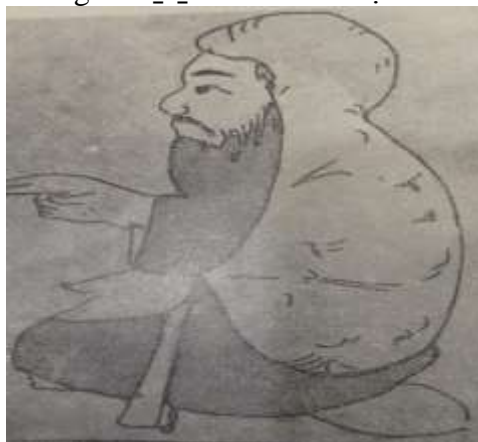
Fig. 3 Aṭ-Ṭailāsan al-Muḥanak

Al-‘Abīdī, Ṣ. Ḥ., Malābīs al-Qūḍāh wa Qāḍī al-Qūḍāh fi Al-‘Aṣr Al-‘Abāsī, p. 33, fig. 2