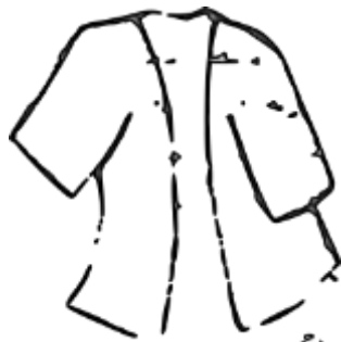
Fig. 5 ‘Aba’h Khashinah “Kibr”

Māḍī, I., Zi Ūmārā’ al-Mamālīk, Al-Hāi’ah Al-Miṣrīyah lil Kitāb , al-Qahirah, p. 286, pl. 29