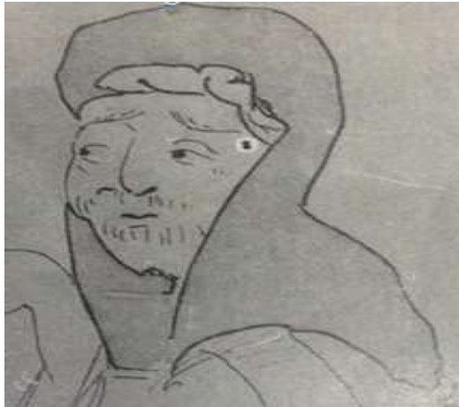
Fig. 1 Mantilla “Aṭ-Ṭarḥah” in the ‘Abbasid era

Al-‘Abīdī, Ṣ. Ḥ., Malābīs al-Qūḍāh wa Qāḍī al-Qūḍāh fi Al-‘Aṣr Al-‘Abāsī, p. 31, fig. 1