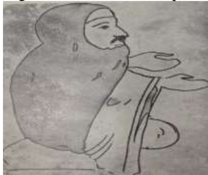
Fig. 4 At-Tailasan al- Muqawar

Al-‘Abīdī, Ṣ. Ḥ., Malābīs al-Qūḍāh wa Qāḍi al-Qūḍāh fī Al-‘AṣrAl-‘Abāsī , p. 33, fig. 4