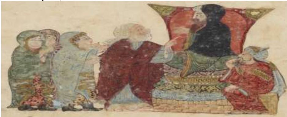
(Pl. 6) Aṭ-Ṭailāsān al-Muḥanak ; is depicted on a miniature of a judging council. Maqāmāt Al-Harīrī (Fortieth - Maqama)

http://gallica.bnf.fr/ark:/12148/btv1b8422965p/f60.image