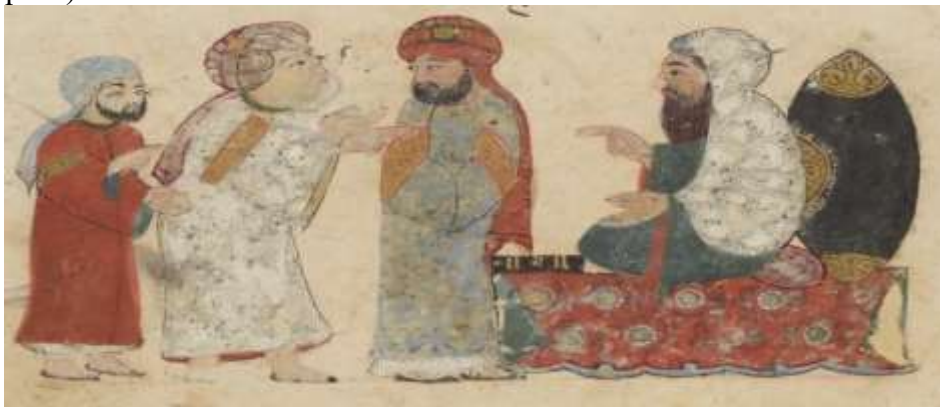
(Pl. 7) Another sample of aṭ-Ṭailāsān al-Muḥanak is a miniature of Maqāmāt Al-Harīrī (thirty-seventh maqāma)

http://gallica.bnf.fr/ark:/12148/btv1b8422965p/f60.image