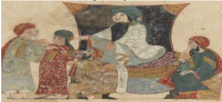
(Pl. 5) A sample of aṭ-Ṭailāsān Al-Mūqawar appears in a miniature of Maqāmāt Al-Harīrī (Eighth- Maqama)

http://gallica.bnf.fr/ark:/12148/btv1b8422965p/f60.image