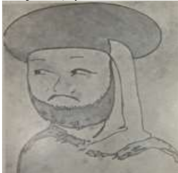
Fig. 2, Al-Qurqufa in the ‘Abbasid era

Al-‘Abīdī, Ṣ. Ḥ., Malābīs al-Qūḍāh wa Qāḍī al-Qūḍāh fi Al-‘Aṣr Al-‘Abāsī, p. 33, fig. 2