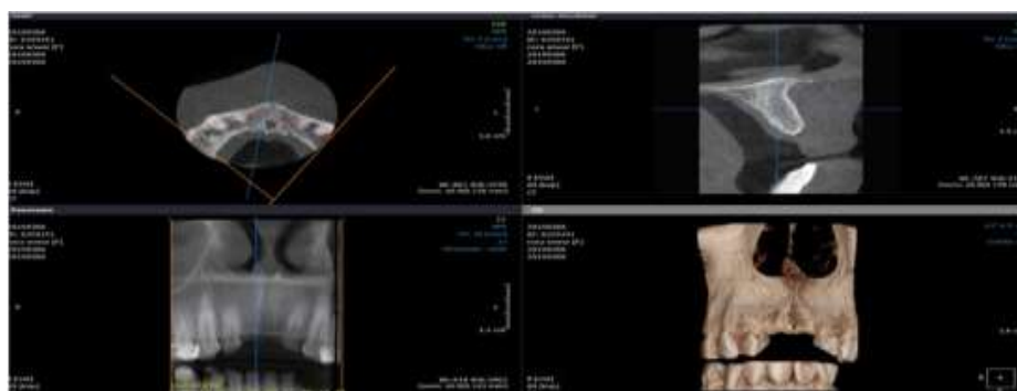
Figure (1): Preoperative CBCT for examination and case selection