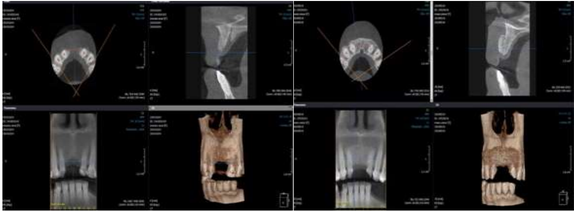
Figure (8): postoperative CBCT