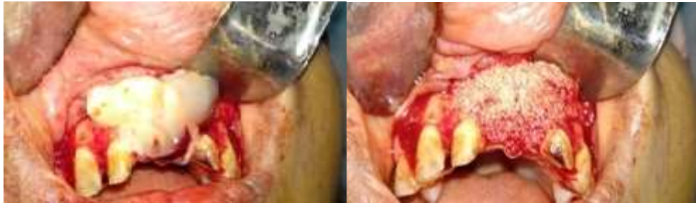
Figure (4): Insertion of the MPM Mixture as onlay in surgical site and insertion of PRF over MPM Mixture as an autogenous membrane