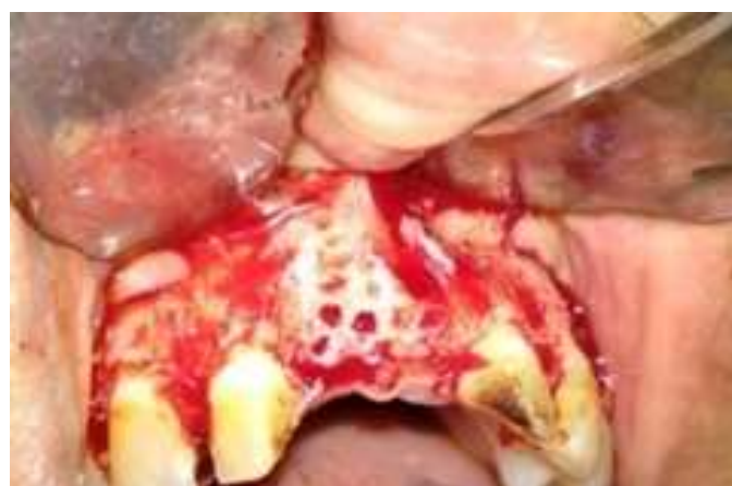
Figure (2): Trapezoidal flap, Bone decortications minimally with depth 0.5 in cortical bone