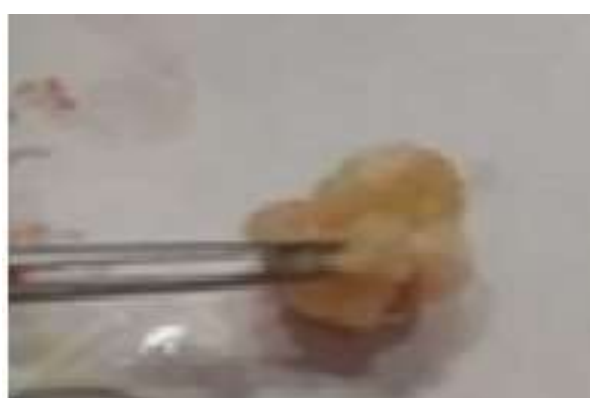
Figure (3): MPM before application to surgical site