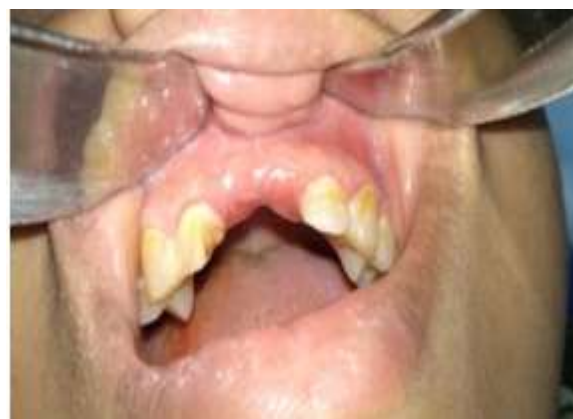
Figure (7): Case number 2: postoperative clinical photo after 6 months