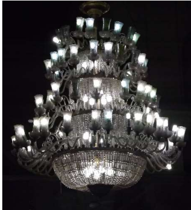
Fig 3 large chandelier in a mosque contains 80 lamps