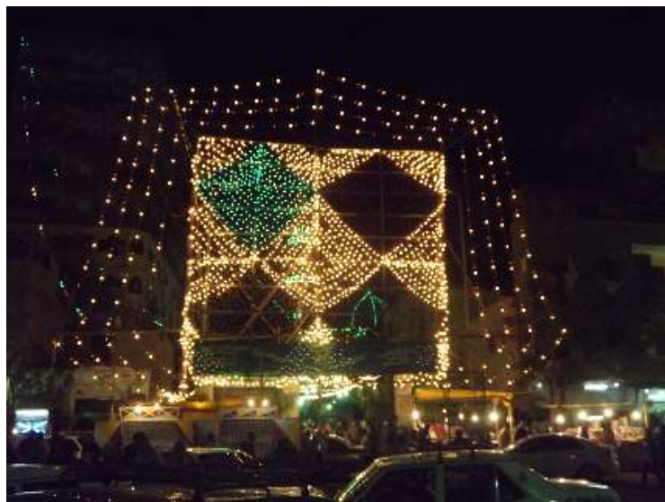
Fig 4 Exaggerated lighting decorations