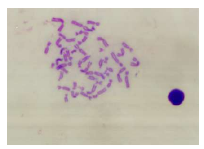
Figure 2. Photomicrograph showing human lymphocyte in negative control