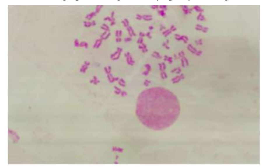
Figure 3. photomicrograph showing human lymphocyte with deletion and fragment.