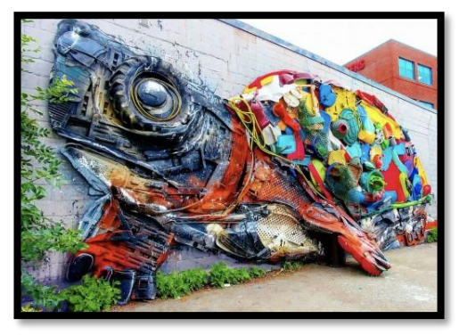
(Figure 9, mixed media (trash), Bordalo II, 2017)

from the streets to create impressive animal sculptures to warn people about pollution and all sorts of endangered species. It was from street art that he developed his practice and evolved into what is now considered "trash art". His installations "Big Trash Animals", scattered in public or museum gaps around the world, address the need for socio-ecological sustainability. In the streets of his hometown, 's series of works "Provitive" and "Train Tracks" interact with fabrics and street furniture and present a new critical view of society, its actors, and determining factors.