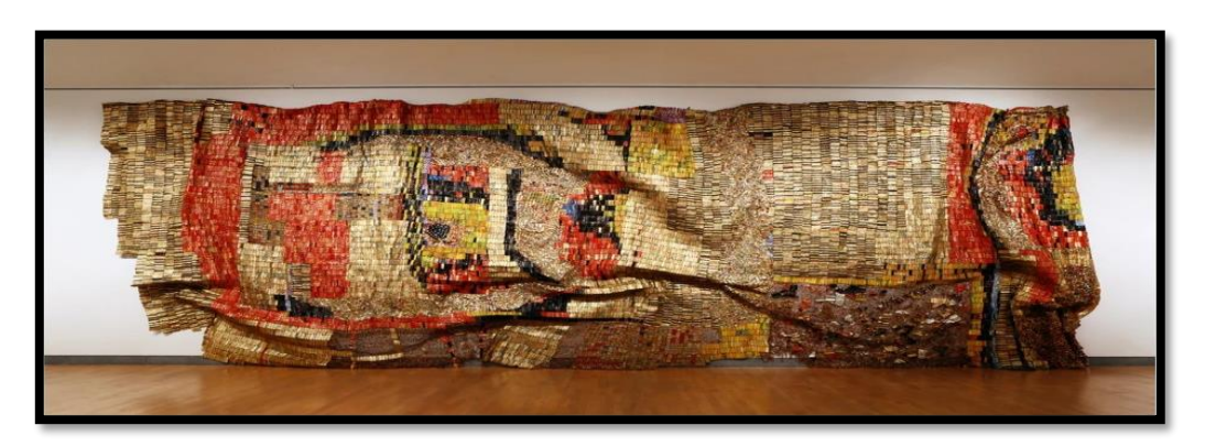
(Figure 6 El Anatsui, Earth's Skin, Aluminum and copper wire, 2019)

Recently, environmental art has become more closely intertwined with the political, cultural, and economic dimensions of environmental upheaval. Art helps dissidence and social change. The Global South has numerous artists critical of these issues, some voicing their concerns through a return to traditional and ecological materials for the construction of tapestries, sculptures, and installations. It has been hypothesized that valuing the aesthetic values of nature promotes environmental ethics and correlates with a sustainable lifestyle. (Richardson). Art has played a very important developmental role throughout the ages and historical stages. While all countries are looking for ways of sustainability on the economic and political levels, and they are pursuing medium and long-term strategies to achieve this, a contemporary artistic trend has emerged that aspires to contribute to achieving sustainable development goals through arts. Being a mirror that reflects the social and cultural reality of the people. Fig 6 here the artist not only uses law-impact materials but indeed real aim objects that would otherwise be wasted. The diversity of artists' reactions and creative processes is something that has always been captured, after an industrial or technological boom, material culture often changes to glorify man-made products that are viable and profitable to manufacture. However, there is eventually resistance to this and a resurgence of craft-intensive decorative arts.