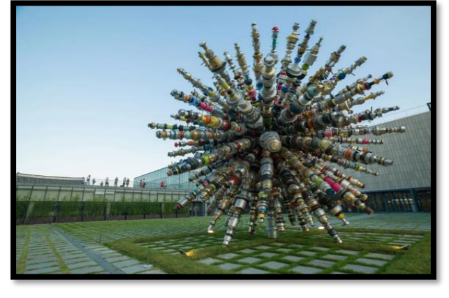
(Figure 2, with or Without Us" from the Sea Wall initiative by Ernesto Maranje, 2017)