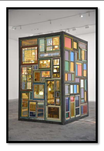
(Figure 4, Song Dong, Same Bed Different Dreams No. 3, 2018)