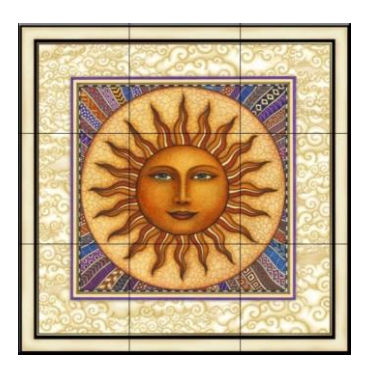
(Figure 8, tile mural features the artwork of Dan Morris and contains images of the Sun, 2015)

Analysis of various painting reveals the creative template, the alternate materials and vision of the artist. This has become very significant in the 20<sup>th</sup> century even as artists adopt specific colors in their representation. (Philippe Walter, Laurence de Viguerie.)