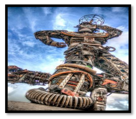
(Figure 10 La Nouvelle Liberté artwork by Joseph-Francis Sumégné, 1996)

This century has seen several important advances in the use of advanced innovation. The crude innovations captured the intriguing thoughts of contemporary artisans and connected them to a variety of imaginary influences, including unused measurements on works of art that reflect the character of the 21st century. Since the aim here is to create a contemporary mural while preserving social subjectivity, the inference of craftsmanship in our society is that of craftsmanship. It must be borne in mind that ingenuity and the mental underpinnings of the environment make a difference in deciding how to secure his aesthetic identity from impersonation. Environments contain aesthetic, social, and creative personalities, and mural depictions inspire interest in works of craftsmanship that are deeply rooted in society. It's about affiliation Recycling has several purposes and reasons, in addition to its contributions, which include reducing the burden on the ecosystem, achieving economic returns by reducing the need for raw materials, and saving the energy needed to produce raw materials. Among them, artistic trends, many artists have embraced the idea of recycling to make youthful, new and updated content and concepts. (HALLOUL)