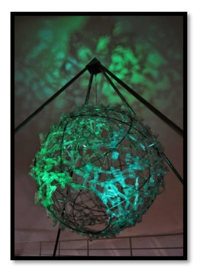
(Figure 7, Glass installation, Debora Muszkat Institute, São Paulo, 2014)

they're utilized to construct products, and supply services, still as improve the environment, resembling structures. Each year, over 3 billion heaps of raw materials are consumed by development operations around the world, accounting for the fourth part of total resource consumption. The goal of sustainable interior design is to rationalize the utilization of materials in an associate degree ingenious method that permits the preservation of natural resources while not inflicting environmental degradation. (Ahmed). Recycling - is a technology that proposes reusing old or discarded things, to create new products, using creativity and respect for the environment. For the artist, this is one of the most important points: the continuous surrender of solid waste through art and sustainability. Fig 7 Create a magical world of reflections, lights, and colors through something whose value ceased to exist from the moment it was called "garbage": this is how Brazilian plastic artist Debora Muszkat does it. Through his hands and those of his students, the glass discarded in the environment is transformed into incredible objects and installations, in a process where art and sustainability are inseparable.