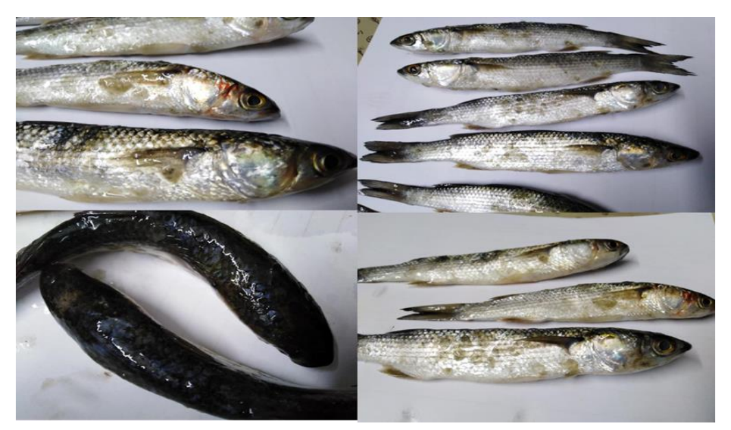
Fig.(1): Clinical signs finding of the examined Liza ramada . (A) Naturally infected Liza ramada showing its very lean compared to the age of the fish and hemorrhages around the mouth opening and operculum (B) Diseased fish showed emaciated with thinning of the head (C) Naturally infected Liza ramada showing dark coloration of skin, detached scales and superficial ulcerations. (D) Naturally infected Liza ramada showing abdominal distension.