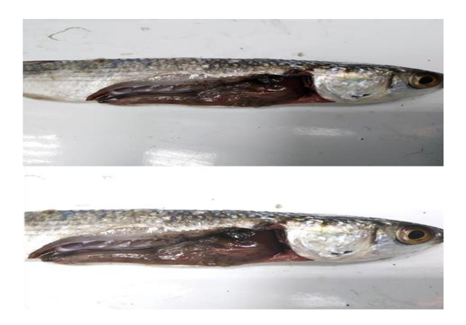
Fig. (2): Post mortem finding of the examined Liza ramada , naturally infected fish showing marked adhesion of the internal organs and sever congested kidney, congested spleen and liver, enlarged gall bladder, ascitic fluid in the abdominal cavity.

Fig.(1): Clinical signs finding of the examined Liza ramada . (A) Naturally infected Liza ramada showing its very lean compared to the age of the fish and hemorrhages around the mouth opening and operculum (B) Diseased fish showed emaciated with thinning of the head (C) Naturally infected Liza ramada showing dark coloration of skin, detached scales and superficial ulcerations. (D) Naturally infected Liza ramada showing abdominal distension.