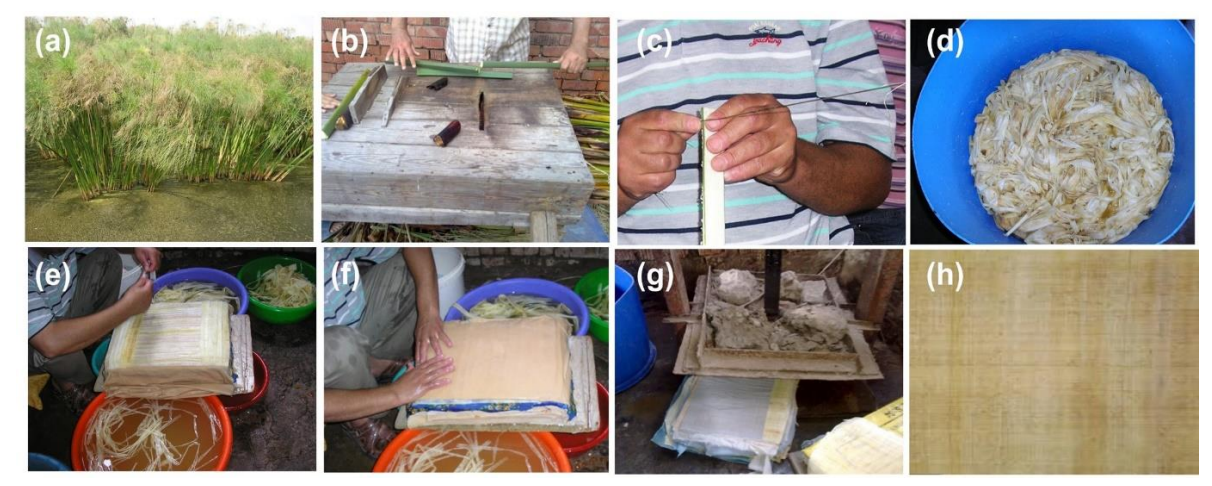
Fig. 2. Commercial papyrus manufacture at Qaramos, Egypt. (a) Papyrus plants ready for cultivation; (b) Cutting the stems using an electrical cutter; (c) Slicing the papyrus stem into strips with a nylon thread; (d) Soaking papyrus strips in a dilute sodium hydroxide solution; (e) Layering the strips into orthogonal layers; (f) Placing papyrus sheets between linen and cardboard; (g) Pressing papyrus sheets using a manual press; (h) A final papyrus sheet.

The pH values of commercial papyrus sheets from the same village visited by the author ranged from 7.9 to 9.8, which can be attributed to the alkaline treatment step during papyrus sheet manufacture, while the pH of ancient papyrus in general ranged from 5.5 to 6.0 [67].