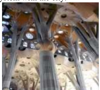
Fig (4) the principles of engineering, which are composed of geometric patterns of straight lines yet produce three-dimensional curved surfaces, were inspired by nature. Antonio Gaudi used these principles to build vaults, walls, and columns.

Vernacular Architecture is one of the local cultural environmental trends, which expresses traditional societies, and the compatibility with the local environment, that environment that represents the most important factor influencing the recipient's perception of his space, and it is the result of a collective process that is formulated through spontaneous and continuous activity between each group with a working and effective heritage through A unified and joint collective experience, and the design product is compatible with the natural, ecological and built environment, with the recipient's thought and traditions, and environment that has arisen over the years and develops until it settles on a comfortable situation physically, visually and intellectually, often organically based on natural shapes and facilities and simple local materials. [5]