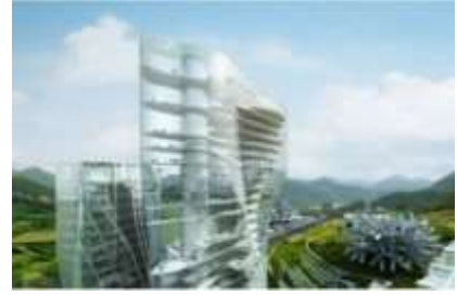
Fig (11) Twists In the center of Haxifei, Guiyang, China A group of separate buildings that seem to have grown from nature to be put together in a way that represents the cultural difference of that region

The plurality in cultural disciplines was represented in architectural production and interest, and pluralism dominated architectural works and diversity, difference, abundance, and enrichment. The change in architectural performance has always had its own reasons, which may be restricted to:-