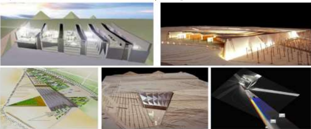
Fig (5) The Grand Egyptian Museum was designed by the Irish engineering firm Peng Architects, who took into consideration the height of the walls up to the dimensions of the Great Pyramid so that if we build a straight line from the end of the museum's walls, it will reach the highest peak of the Great Pyramid in the area of the pyramids. The design philosophy expressed the Nile River with the beam that connects the museum to the pyramids, and the pyramids were also represented in the lines divided into four sections

To totally remove a structure's existence as a visual obstruction or to scale it back as a participant in urban group blocks, one portion of the building may be buried while another may rise above the surface. The Sun Boat Museum's architect made the error of depicting the entire structure as being attached to the Giza Pyramids, one of the Seven Wonders of the World and transforming it into a civilized distortion. Visual architecture is a crucial component of the architectural form and its internal spaces. With a contemporary sense of this overlap, many of the contestants- in the international competition that was held in