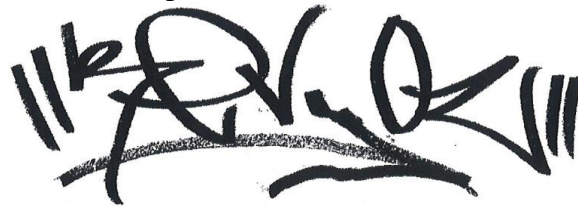
Fig. 3. "Rev. OZ," photograph from Wayde Compton, "GHETTO FABULOUS OZYMANDIAS," Performance Bond , Vancouver, B.C., Canada, ARSENAL PULP PRESS, 2004, 154.

Compton scratches the throw-up of "Rev. OZ." (70-76) or "Revolutionary OZ" (48) in the font of "Oswald" (55) on an imaginary wall beside the verse lines of the poem: