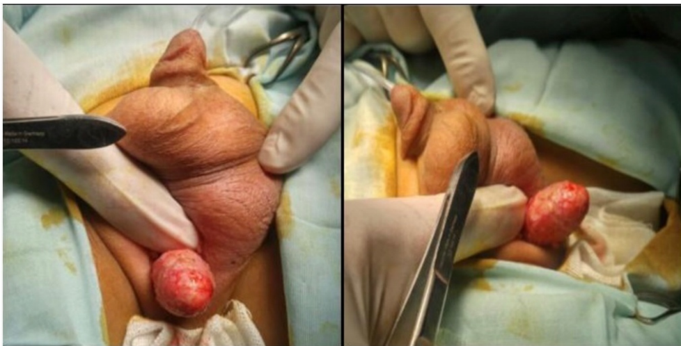
Figure 3. intraoperatively the cyst extended from the root of penis to the perineum and was separable from the urethra and both testes.

The swelling was surgically excised as a day-case procedure through a longitudinal midline incision in the perineum. (Figure 3). The cyst was not attached to the skin. No intraoperative complications were encountered. The lesion exhibited a gross picture (Figure 4) of epidermoid cyst filled with grayish pasty material with no gross adnexal structures, as well as a microscopic picture (Figure 4) of stratified squamous lining with secondary ulcerations. Two-year follow-up revealed no evidence of recurrence nor other complications.