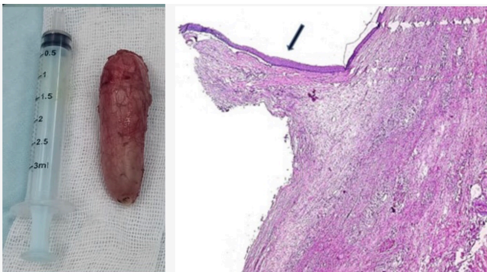
Figure 4. The gross picture of the intact unilocular cyst 5x2x1.5 cm with a smooth surface and its stratified squamous lining with secondary ulcerations (haematoxylin and eosin stain, magnification x100).