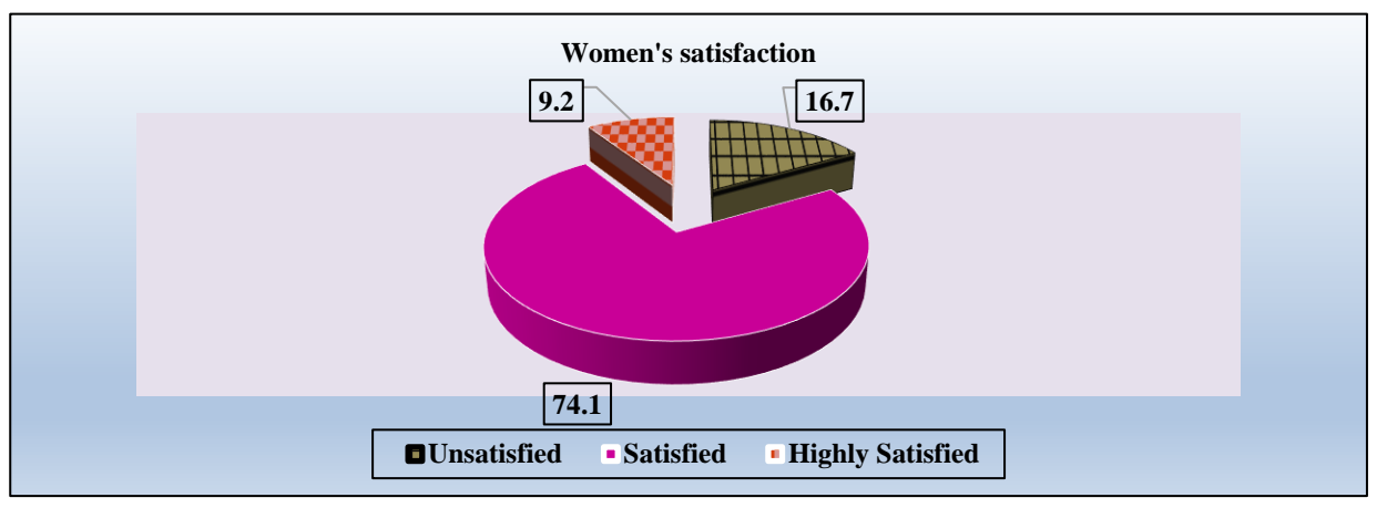
Figure (2): Satisfaction of the studied sample's (study group) regarding Benson's relaxation technique application

Figure (1): Distribution of the studied sample's (PUQE) index regarding severity of nausea and vomiting in both study and control groups before and after intervention (n =108).