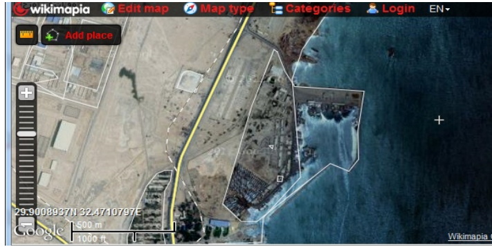
Fig. (1): Attaka fishing port on Suez bay from where the Samples were randomly collected.