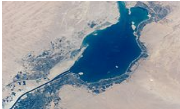
Fig. (2): Murrah Lake at Ismailia city from where the Samples were randomly collected.