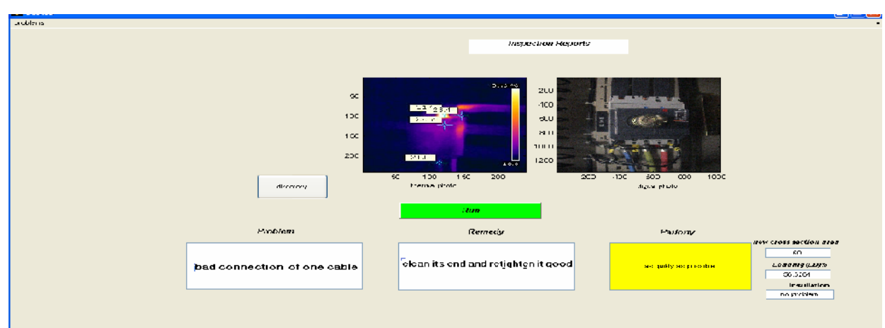
Figure(3): Report (1), Heating along 20 cm of one core, SU= 2.