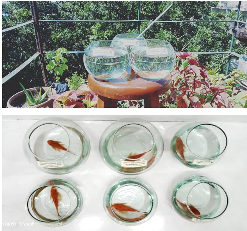
Fig. 1. The experimental set – ups of Ancistrus sp. orange . (a) Warm temperature; (b) Normal temperature

The aquaria were cleaned after two days with 10% (82.5 mL) of water changes were made. The janitor fishes ( Ancistrus sp. orange ) fishes were acclimatized to adapt to water conditions. Afterwards, janitor fishes ( Ancistrus sp. orange ) were acclimatized to two different temperature set-ups: i) the normal temperature (21 °C to 26 °C) and ii) the projected temperature that they may endure in the future. At the end of the experiments, the janitor fishes ( Ancistrus sp. orange ) were released in the river without injuries.