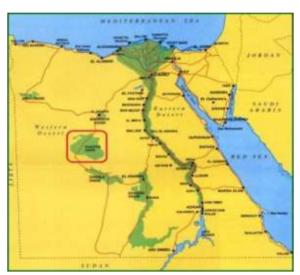
Fig. (1) Location map of the studied area

The adopted rate of sand was added by loader machine and compost was added by weighed bags. They are mixed into the soil by plow machine at 15 cm, which makes the addition homogeneous.