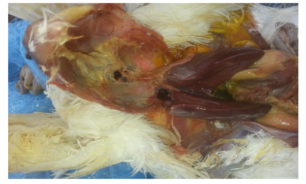
Fig. (3):air saculitis, pericarditis and perihepatitis.