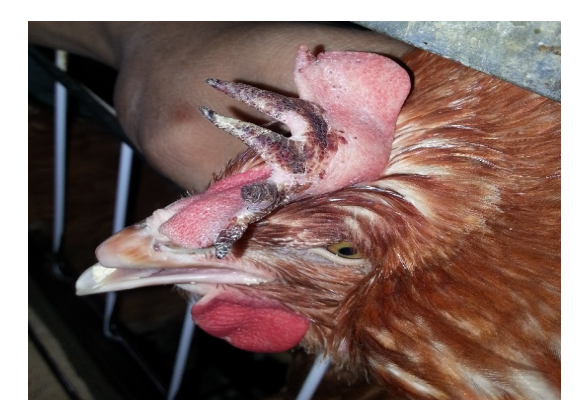
Fig. (2): swelling of comb and wattle.