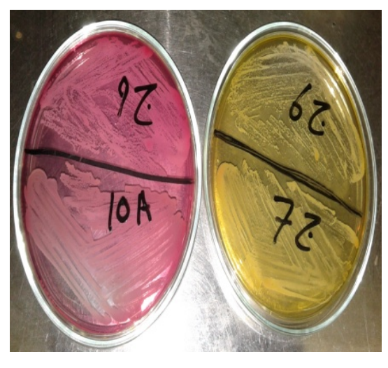
Fig (2): S. aureus and CNS on mannitol salt agar.

Table (4): pigmentation activity among the S. aureus isolated from milk samples.