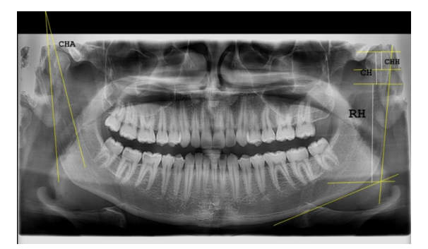
Alexandria Dental Journal Volume 48 Issue 2 Section A

Figure (3): Panoramic radiograph shows CHH, CH, RH, and CHA