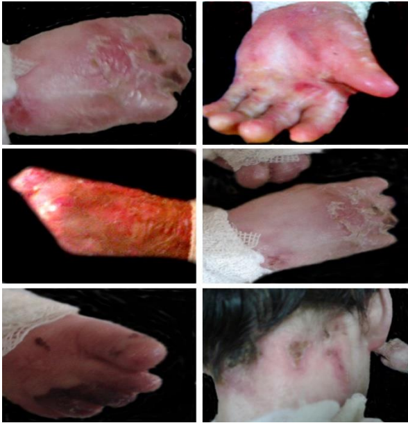
Fig.1 Clinical presentation of patients with Epidermolysis Bullosa.