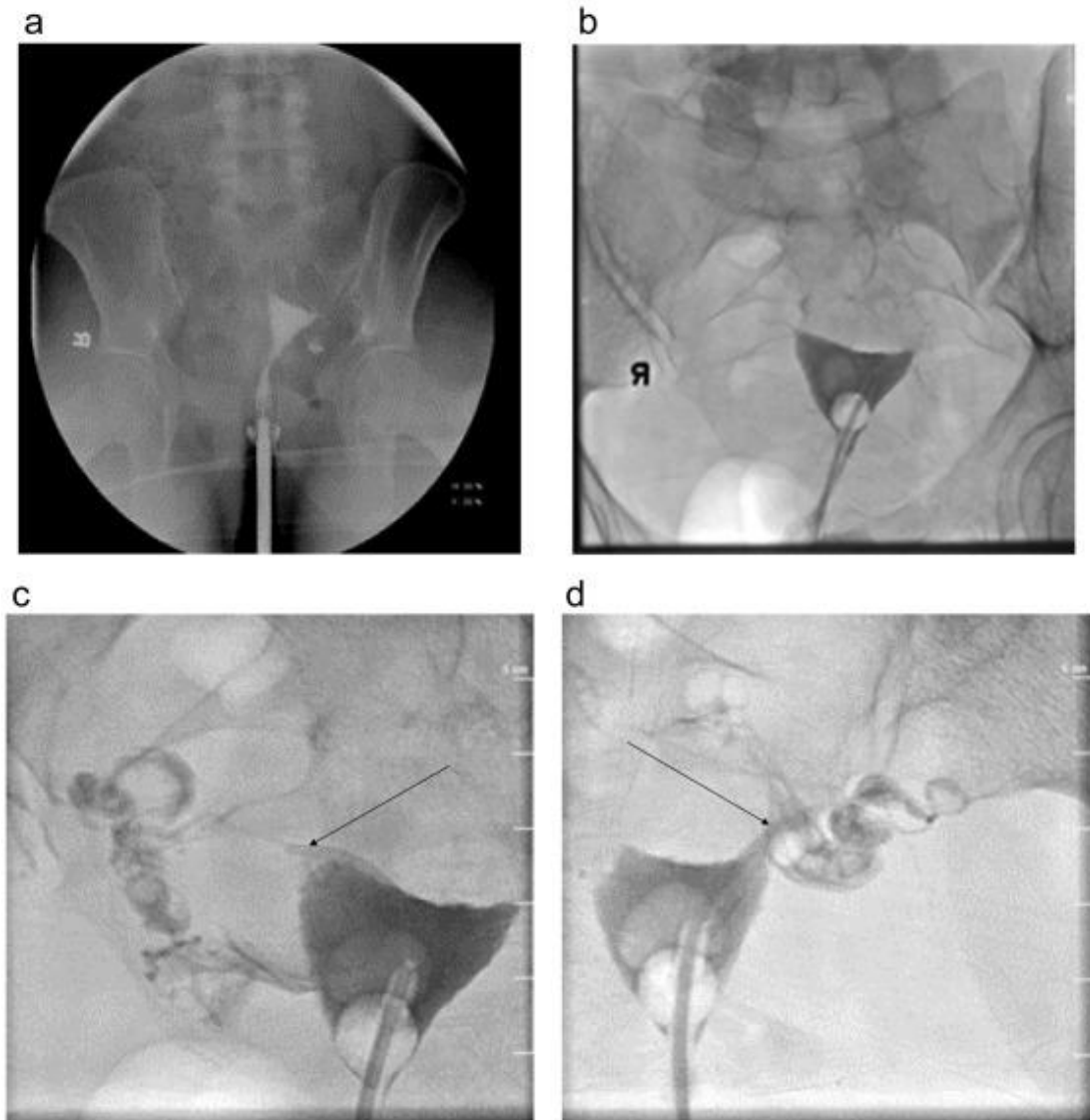
Figure (2): Cannulation of the tubal cervix transcervically in addition to selective salpingography (17) .

Transcervical tubal cannulation and selective salpingography (Figure 2): Under fluoroscopic (17) , falloposcopic (3) , sonographic (22) or hysteroscopic guidance, transcervical tubal cannulation for the reversal of proximal tubal occlusion can be carried out. This procedure is performed in order to reverse proximal tubal occlusion. The inspissated material can be directly mechanically disrupted by threading an atraumatic guidewire through the catheter (also known as tubal cannulation) (23) .