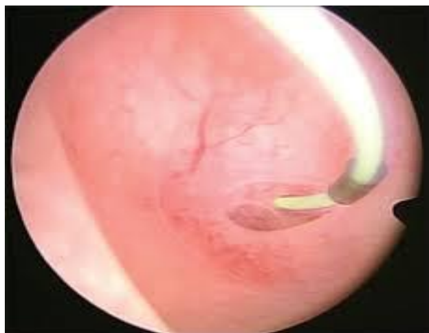
Figure (3): Tubal cannulation guided by hysteroscopy (26) .

The recanalization liquid return is a major focus (26) .