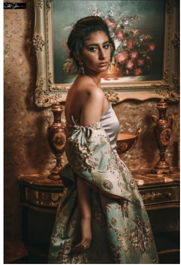
Pic. (13) first look