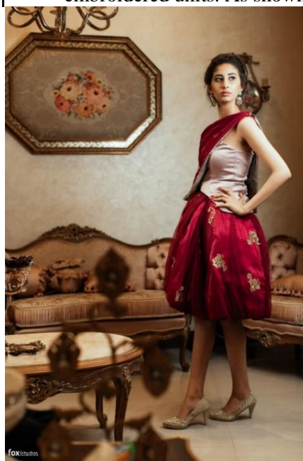
Pic. (14) second look after transformation

converts to a fuchsia bubble skirt with golden embroidered units. As shown in pic. (14)