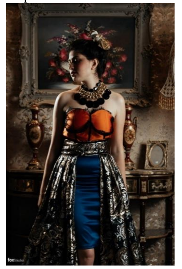
Pic. (7) Third Design look