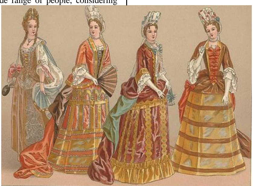
Pic. (5) Baroque fashion style for women

Baroque Fashion: Baroque fashion, prevalent during the 17<sup>th</sup> and early 18th centuries, was characterized by its opulent and extravagant aesthetics. It featured intricate detailing, rich fabrics such as silk and velvet, and structured silhouettes with corsets for women. Elaborate embroidery, lace, and decorative trims adorned garments, while men's fashion showcased decorated coats and breeches. Accessories like hats, gloves, and jewelry played a crucial role in completing the look. Baroque fashion reflected the grandeur and drama of the era, with an emphasis on excess and self-expression, and continues to inspire contemporary designers seeking to incorporate its opulence into their designs.