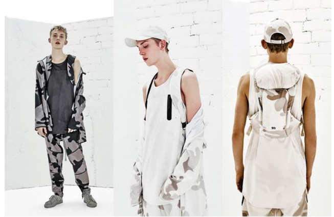
Pic. (1) Jackpack design by Puma LA street-style label Stampd

Fashion Designers used transformation fashion: There are already some designers who have made exploration and trials on multi-functional transformable designs, such as an Italian design label Mandarina Duck designed the 'Jackpack' which is able to transform into a jacket. (Olfat Shawki -2019 - p. 42) As Frequent collaborators Puma and LA street-style label Stampd have released their next collection. The summer-ready pieces come with functional elements, from shapes inspired by the wetsuit, to camo motifs with an urban edge. Designed for those on the move, highlights include the Jackpack, which fuses a jacket and backpack: fold the jacket away and hit the streets and then in seconds the Jackpack can transform back into protective outerwear on-the-go as shown in pic. (1) (https://gulfnews.com)