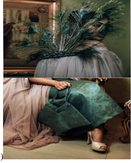
Pic. (11) second look after transformation

3- Third look: a long leather tight cup dress with several layers ruffle short cap with a satin