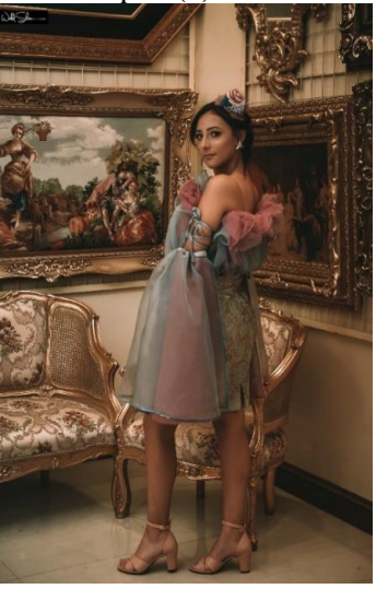
Pic. (8) first look of the second design