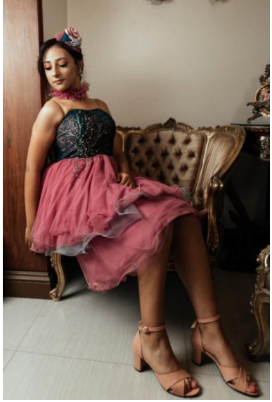
Pic. (9) Second look of the second design