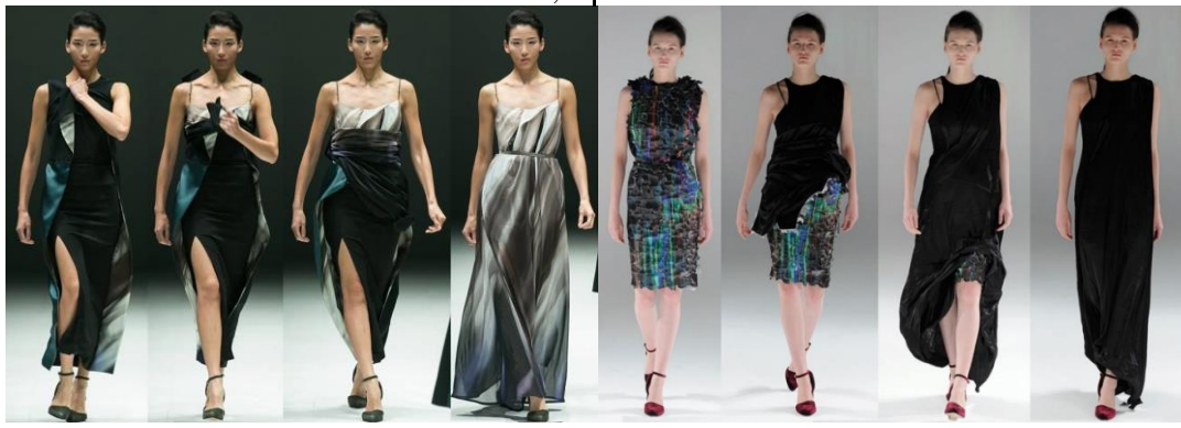
Pic. (2) Transformed dresses by Hussein Chalayan

Chalayan introduced the "Table Skirt," which concealed a wooden frame and transformed into a functional table, challenging fashion boundaries. The "Inertia" collection of Spring/Summer 2009 showcased the "Transformer Dress," utilizing movable parts and a hydraulic system to change shape and silhouette. Chalayan's "Readings" collection for Spring/Summer 2018 emphasized fabric manipulation, with the "Transformer Coat" featuring a detachable bottom half that could be converted into a separate skirt, showcasing versatility and style. These collections demonstrated Chalayan's expertise in merging technology, innovative materials, and fabric manipulation to create transformative and adaptable fashion pieces.