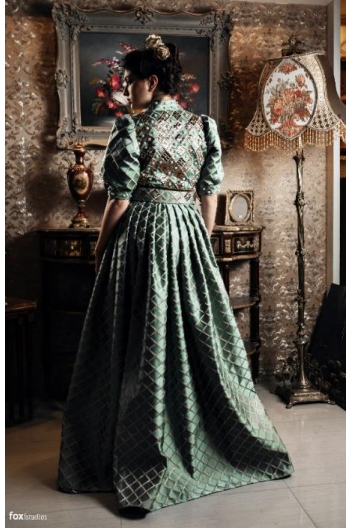
Pic. (6) fourth full pieces look