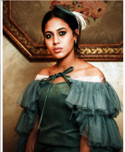
Pic. (12) third look after transformation