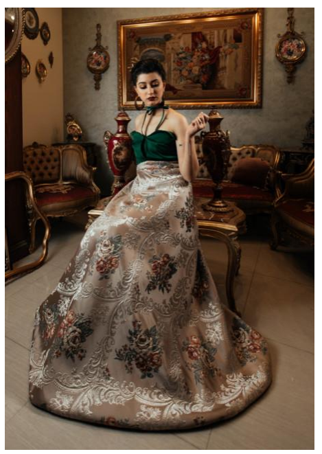
Pic. (15) first look of the fifth design