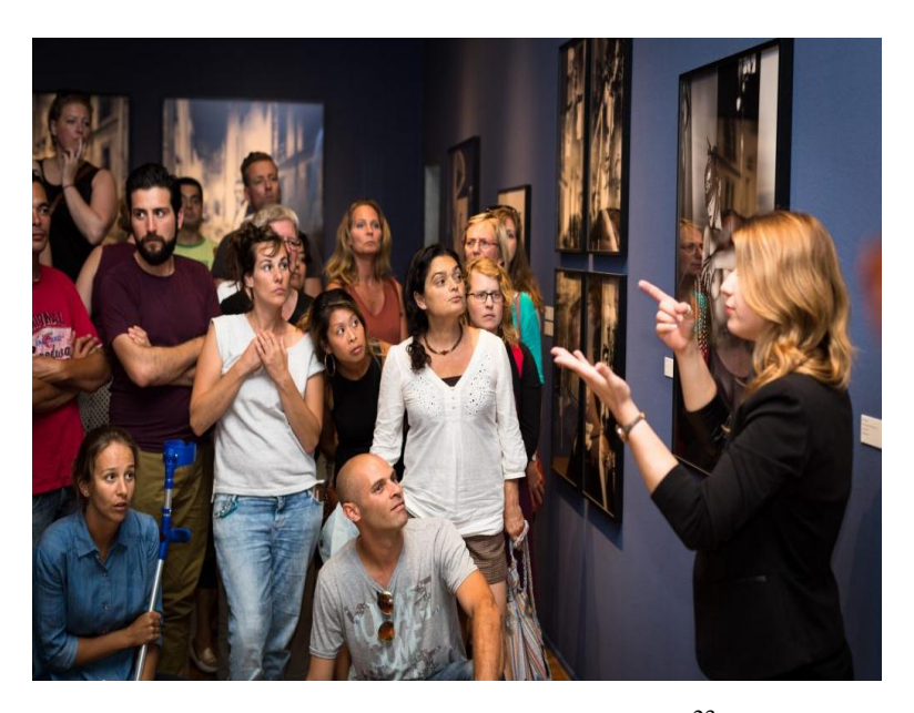
Tourist guides using sign language<sup>23</sup>