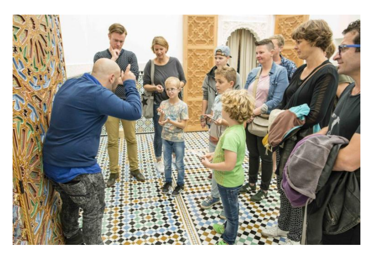
Tourist guide using sign language<sup>21</sup>

American deaf." Journal of deaf studies and deaf education 10, no. 1 (2005): 3-37.