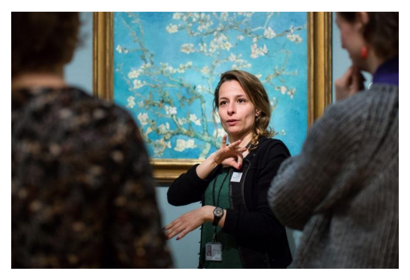
Tour guide using sign language<sup>22</sup>