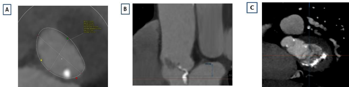
Figure [2]: Example of CT analysis of patient who required PPM post-TAVI. The annular dimension CT analysis [A] with short membranous septum length [B] and severe mitral annular calcification [C]