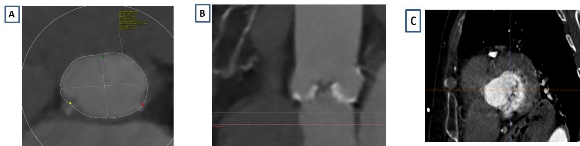
Figure [1]: Example of CT analysis of patient who did not need a PPM post-TAVI. The annular dimension CT analysis [A] with long membranous septum length [B] and no mitral annular calcification [C]