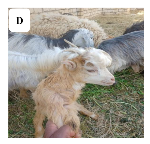
Pale mucous membrane of eye in goat