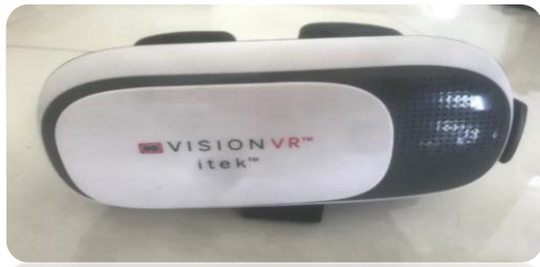
Figure I): Vision VR™ itek™