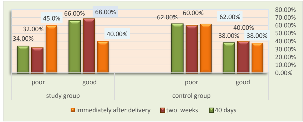
Figure 1): percentage distribution of studied women control and study) groups regarding total knowledge score of care bundle prevention of puerperal sepsis throughout the study phases n=100).