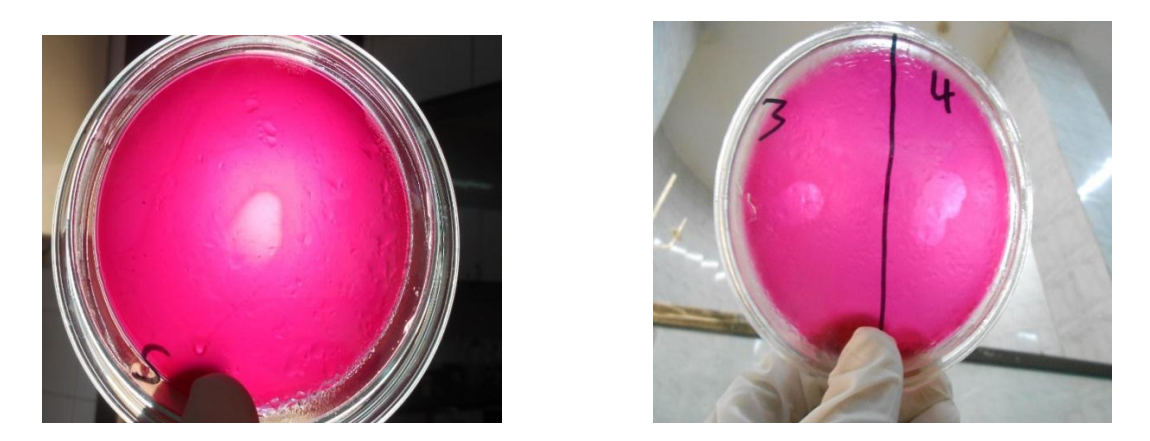
Fig. 4. Spot test showing the bacterial lysis caused by virulent bacteriophage specific for Salmonella typhimurium

Fig. 3. Electron micrograph of purified Salmonella bacteriophage negatively stained with 2% uranyl acetate (Magnification X-80000)