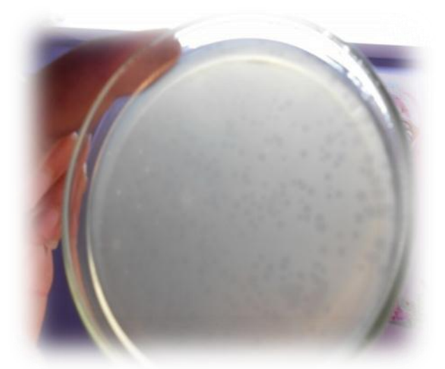
Fig. 5. Plaque assay showing identical morphological plaques of Salmonella typhimurium

Furthermore, the persistence study on the selected phage indicated its resistance ability towards a range of temperature degrees or pH values (Table, 2) making it could be suitable for the condition of Kariesh cheese manufacturing.