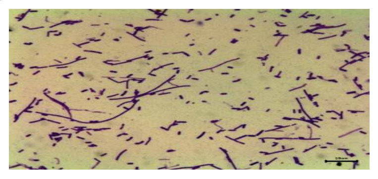
Photo 1. Microscopic characterization of isolated strain (L. plantarum)

The lactobacilli's and L.plantarum microbial population cultivated on MRS revealed that the highest bacterial level was represented in raw milk followed by yoghurt than cheese (Table1). This research showed that the Lactobacilli were the most common bacteria isolated (72 samples out of 94), The predominant lactic acid bacteria found in milk and milk products was L. plantarum . Out of 94 samples, only fifty one was considered as L. plantarum (Table 2), which has a distinctive feature of positive Gram stain, negative for catalase, negative oxidase and positive glucose fermentation. The Gram stain of the isolates was assessed by light microscopy after the staining. L. plantarum is known to be Gram+ve (Photo 1).