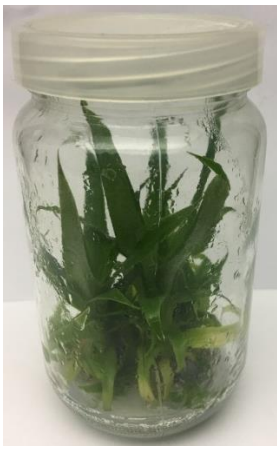
70 g/l of Potato starch