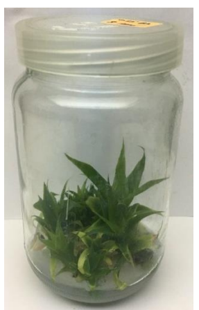
Control (8g/l Agar)

As shown in Tables 1 and 2 and Plat. 1 supplementation of the medium with potato starch alone without agar addition produces semi-solid media status. While MS media supplemented with agar alone at 8 g/l or all combination treatments between agar and potato starch produced solid medium. Furthermore, all rates of potato as a gelling agent (40, 50, 60 and 70 g/l) alone or in combination with agar (at 2.0 or 4.0 g/l) recorded 100 % shoot proliferation. In addition, using 70 g/l potato starch individually as gelling agent produced the maximum growth values for all Yucca_elephantipes L. growth parameters i.e., fresh and dry weight of cluster and shoot (g) as well as the number of leaves/shoot and shoot length (cm), which gave, 5.91 and 0.45 (g) as well as 13.05 and 3.47 cm; respectively with increasing percentages estimated by 14.76% and 36.36% as well as 54.44% and 160.90 % for these traits, respectively compared with control mean values (8 g/l agar). Moreover, the combination between 4 g/l agar and 40 g/l potato starch as gelling agent significantly produced the maximum value regarding the number of shoots/explant (16.40) compared to the control and the other combinations under study.