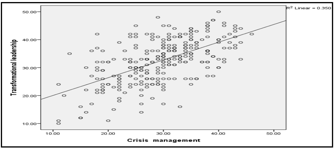
Figure (1): Correlation between CM and transformational leadership (n=282)