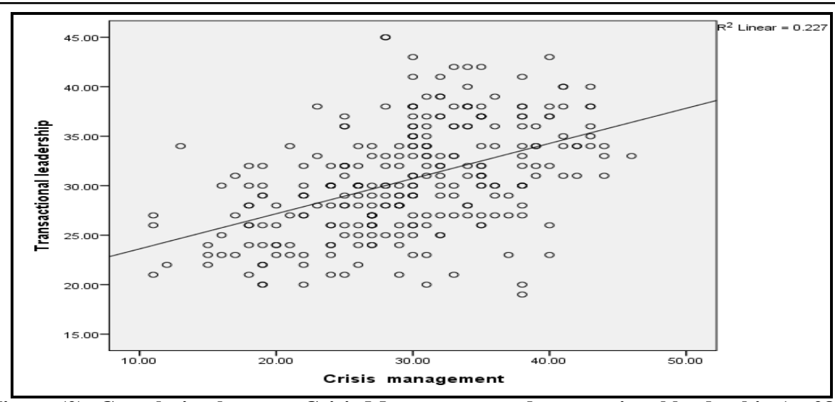
Figure (2): Correlation between Crisis Management and transactional leadership (n=282)