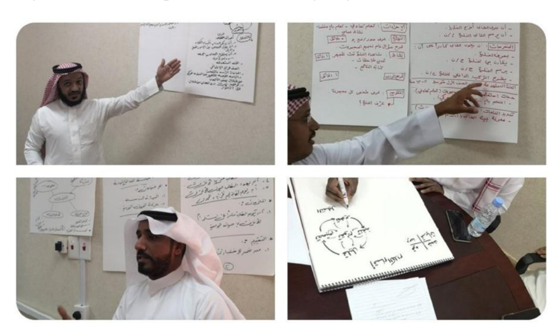
Figure 4. Teachers' presentation of designing their lesson

The third day was divided into two sections; the first was about reviewing active learning strategies, such as problem-solving, learning cycles, projects, dialogue, discussion, and discovery learning. Afterward, participants were asked to find a way to use and choose the related strategy to their design. However, the last section was a practical section on designing a lesson based on the ADDIE model with implementing an active learning strategy based on ARCS and SMART models.