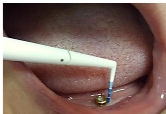
Figure (1): Indices measurement using a plastic probe.

Using a pressure-sensitive plastic periodontal probe that has been calibrated (Vivacare TPS, Vivadent, Schaan, Liechtenstein). Lingually, mesially, buccally, and distally were the four places where the PI and GI were recorded surrounding each implant (Figure 1 and Table 1).