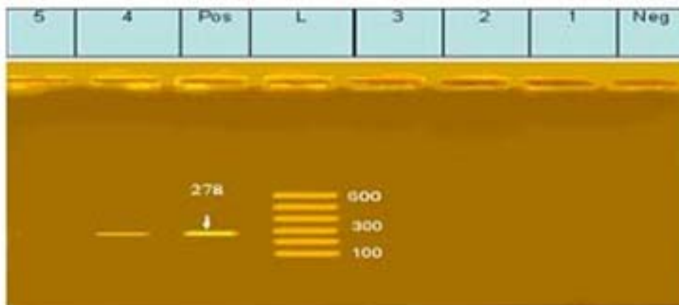
The genomic DNA of 5 Staph. aureus tested using specific primers for the SED gene was amplified in 1 (50%) Staph. aureus strains for automatically packed plain yoghurt isolates and giving product at 278bp. Samples (1, 2,3): balady Plain yoghurt Samples (4,5): automatically packaged plain yoghurt. Lane M: 100-600 bp DNA Ladder. Pos: positive control (at 278bp). Neg: Negative control. Lane 4: Staph. aureus toxin positive. Lane 1, 2, 3, 5: Staph. aureus toxin negative.