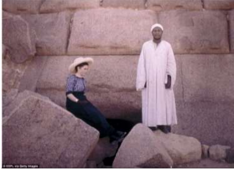
Figure 5: An early tour guide, previously called “dalil”.

After, http://www.dailymail.co.uk (Accessed 26/08/2018)