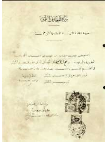
Figure 8 : A graduation certificate of one of the students who graduated from the Archaeological Culture School in 1946.