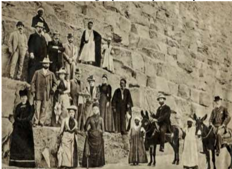
Figure 4 : The idea of the tour group, as conceptualized by Thomas Cook.