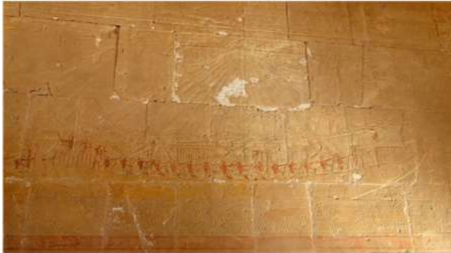
Figure 1: A relief of Hatshepsut's ship at Deir el-Bahari

After, Zakaria, Mohammed (2017) Tourism and Travel in Ancient Egypt: Travel Like an Egyptian , p.36.