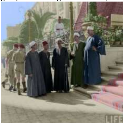
Figure 9: A group of Tourist guides in 1950, Shepheard Hotel

Thus, tourist groups came to Egypt by sea, through the ports of Alexandria and Suez, while some other groups came through Cairo Airport. At that time, the tourist groups were called "Albartita" which meant a combination of different groups. (Fig.9)