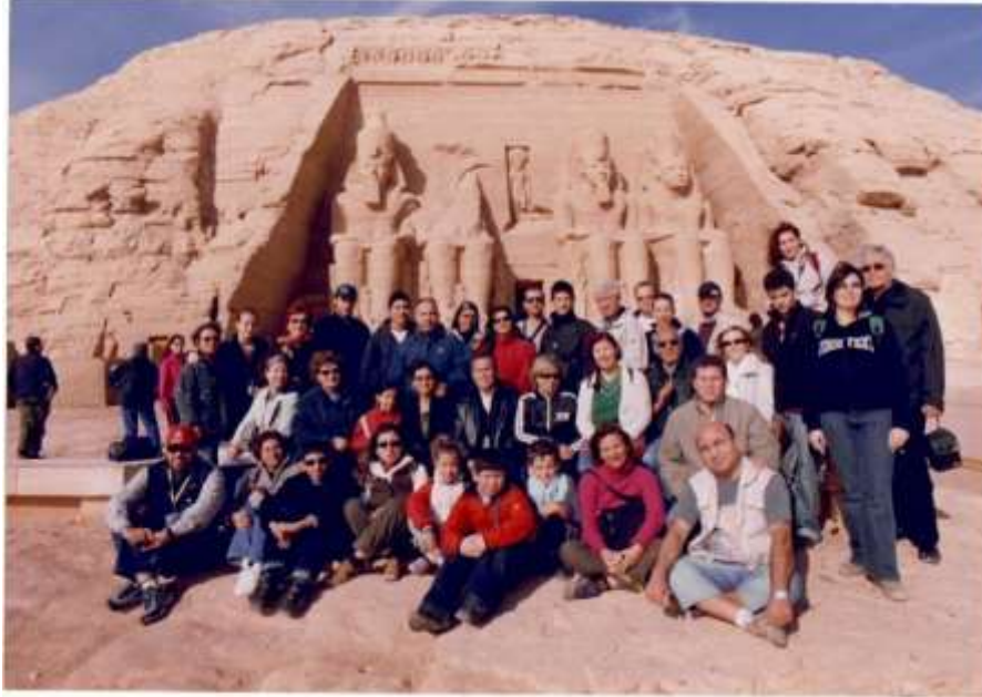
After, the researcher's archive