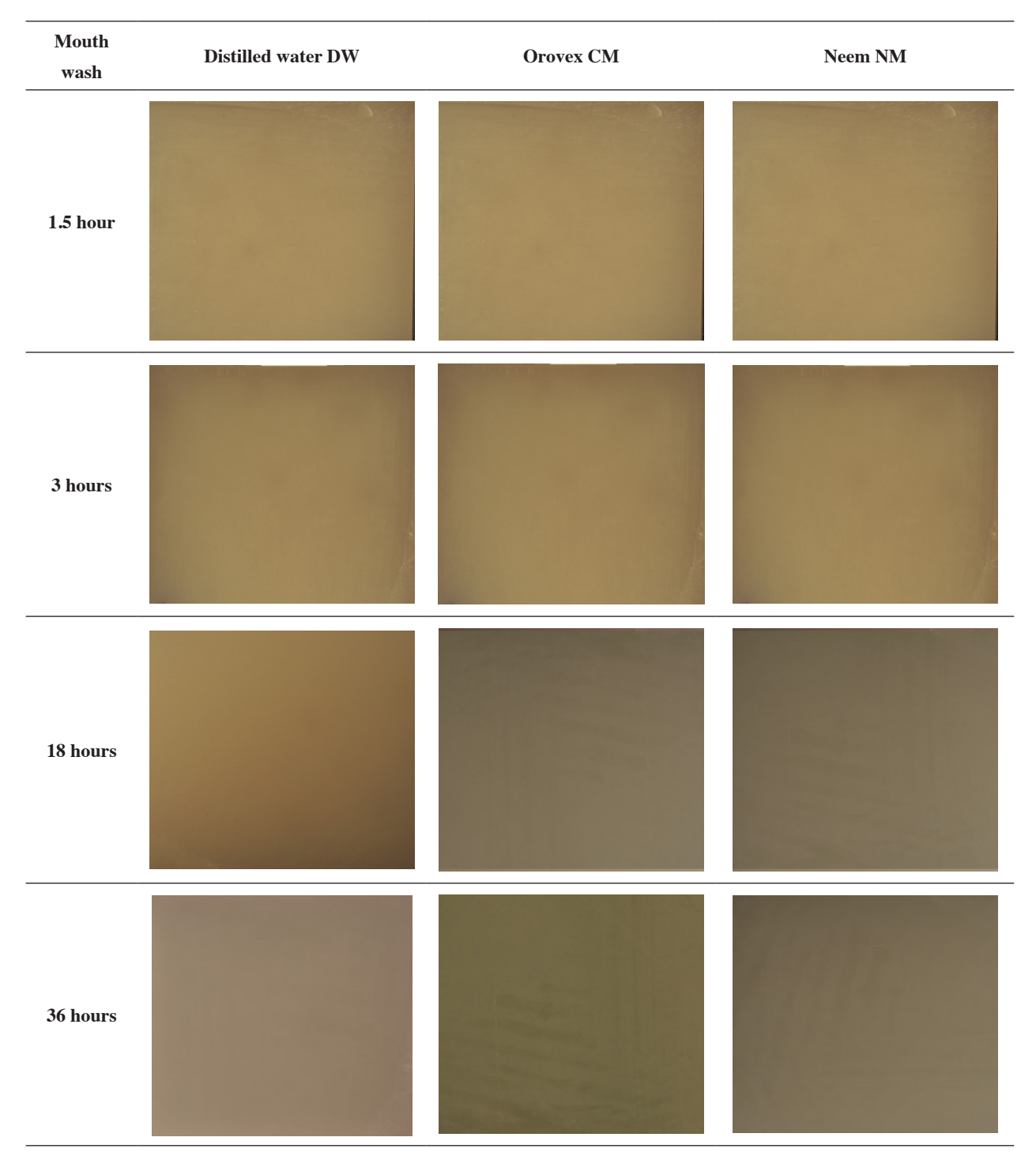
Fig. (2) Photographic images illustrating for the effect of the type of immersion medium and time on \Delta E of Cerasmart.