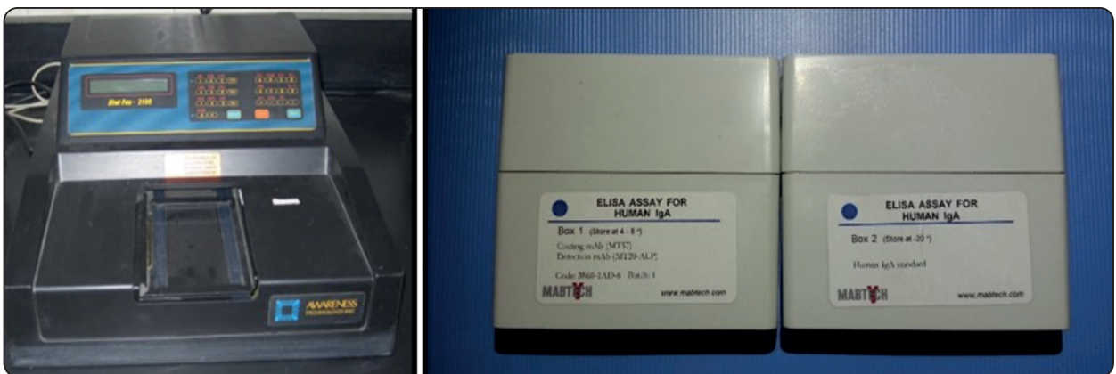
Fig. (2) ELISA Kit for human IgA and its reader