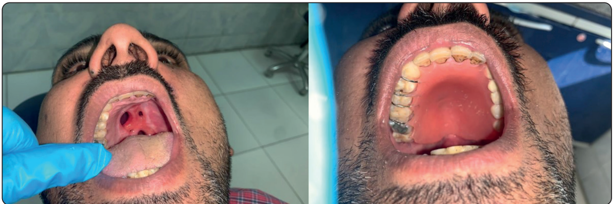
Fig. (1) Hemi-maxillectomy defect and prosthesis in place

Two way ANOVA test was used and the Tukey-Kramer Multiple Comparisons test was used to investigate significant differences among the groups.