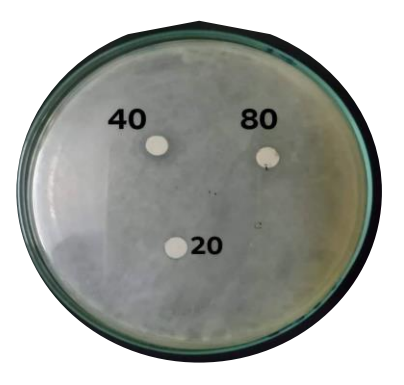
Fig. (1) inhibitory zone of three concentration (80, 40 and 20) % of nano-zinc oxide against p. aeruginosa .