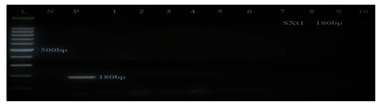
Fig (2-B): Agarose gel electrophoresis 1.5% showed the sxt1 gene of E . coli at (180) bp: Lane M: 100 bp DNA ladder. +ve.: Positive control ( E. coli ) (KY797673), -ve: Negative control Lanes from (1-10) negative samples.