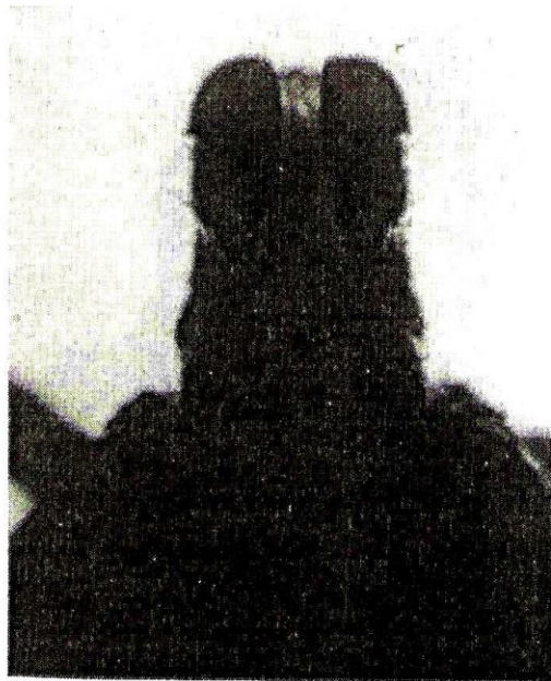
Fig. 6. Anterior part of adult male Hyalomma dromedarii spp. showing the long mouth parts.