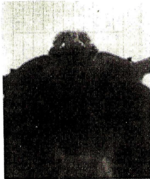
Fig. 1. Anterior part of adult Boophilus annulatus spp. showing the short mouth parts.