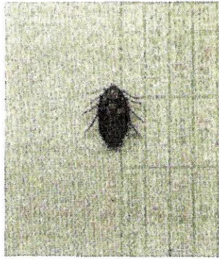
Fig. 1. Adult male Boophilus annulatus spp.