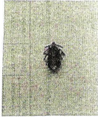
Fig. 2. Adult female Boophilus annulatus spp.