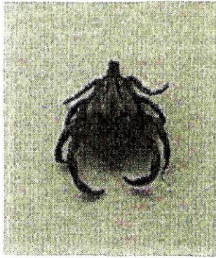
Fig. 4. Adult male Hyalomma dromedarii spp.