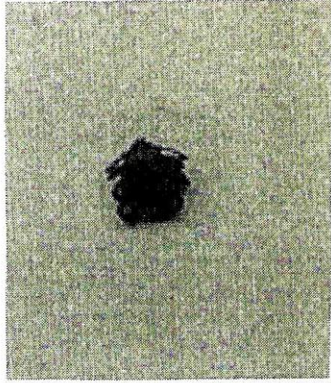
Fig. 7. Adult male Hyalomma anatolicum .