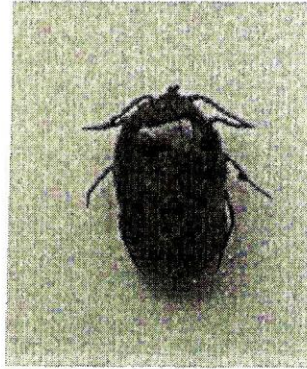
Fig. 5. Adult engorged female Hyalomma dromedarii spp.