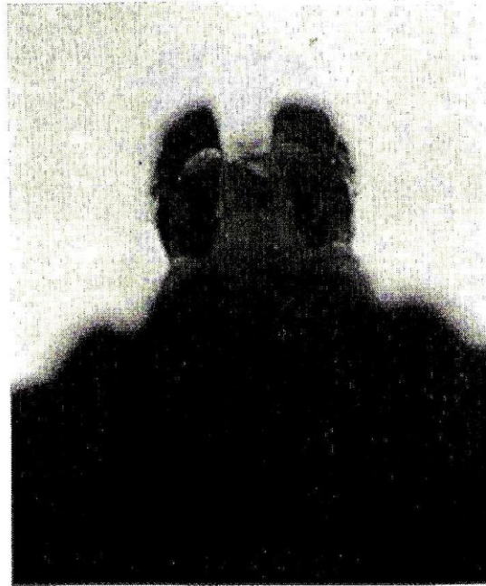
Fig. 6. Anterior part of adult Hyalomma anatolicum . showing long mouth parts.