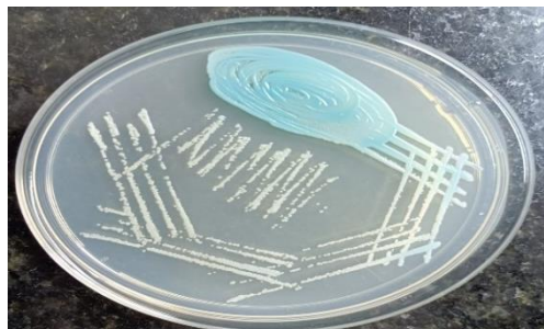
Figure 3. Candida isolation on culture method

Phenotypic assays rely on observing various characteristics, such as colony morphology, biochemical reactions, and growth at different temperatures or on specific media ( Figure 3 ). However, these methods may need more specificity and accuracy, leading to misidentification or difficulty distinguishing closely related Candida species [23]. Furthermore, phenotypic assays may require extended incubation periods, resulting in delays in obtaining conclusive identification. Culture-based techniques involve the growth of Candida isolates on specific agar media followed by a morphological examination. While these methods have been traditionally used, they have limitations, including requiring skilled laboratory personnel, time-consuming procedures, and the potential for contamination or overgrowth by other microorganisms [24].