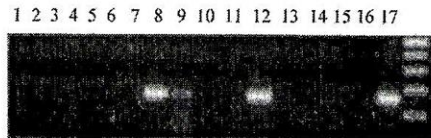
Fig. 2. Agarose gel electrophoresis of PCR products to the TK gene region from rabbit tissues. Lanes 8 and 9 from the same rabbit exhibit a positive reaction product. Lane 12 from a different rabbit exhibits a positive reaction product as well. Lane 17 is a BHV-4 positive control. Lanes 1, 7, 10, 13, and 16 loaded with water. Markers on right from the top: 600, 500, 400, 300 bp ladder.