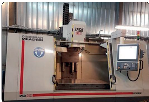
Fig. (1) CNC machine

Standardized mesio-occlusal cavity (MO) was carried out using five-axis CNC machines (CINCINNATI Milacron VT440-41) with water coolant to avoid the effect of heat generation during the teeth preparation and cracking; mesio-occlusal cavity design was done using AutoCAD software, and then transferred to the control panel of the CNC machine (Figure 1) to start the milling.