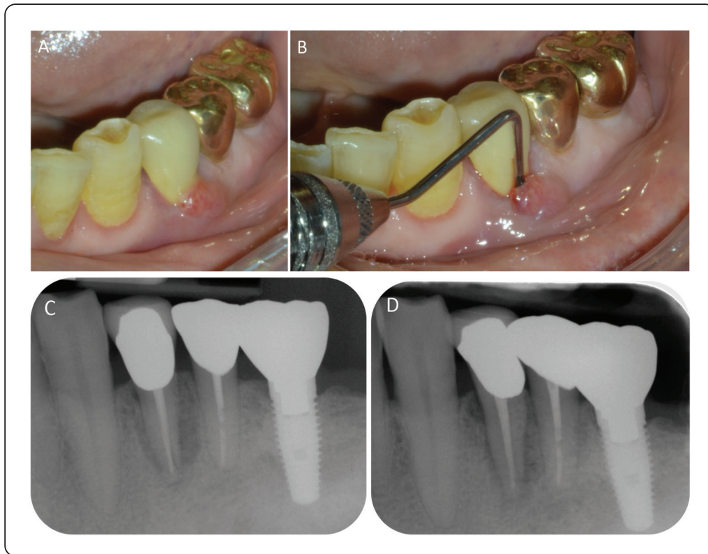
Fig. (2) (A) Clinical image showing buccal swelling related to tooth #34. (B) Signs of occlusal wear. Periodontal probing revealed a deep pocket mid-buccally, reaching the root apex. (C) Periapical radiograph showing a pear-shaped periradicular radiolucency related to tooth #34. This radiograph also shows black lines in the apical third (indicating vertical root fracture) of the same tooth. (D) A radiograph from different angle showing the same black line in the apical third of tooth #34.