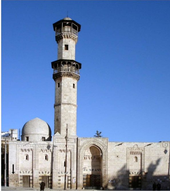
Pl. 1 Al-Utrush mosque in Aleppo, the western façade. The inscription appears at the edge of the façade, below the arrow drawn, (The author, 2005).

entrance of the citadel. Aqbugha al-Utrush, the governor of Aleppo (1398-99 AD) started founding it. This is why it is known as al-Utrush. Its location was the sheep market. Amir Aqbugha also built a tomb within it and dedicated endowments for it. Then, Amir Aqbugha was transferred from the governorate of Aleppo, moving to Tripoli and Damascus, but he returned to Aleppo, then he died in (806 AH/1403). Amir Demerdash al-Zaheri completed the mosque, and dedicated endowments for it, and for this reason, it is also known as Demerdash Mosque (Sibt ibn al-‘Ajāmī 1996, 274) (Al-Ghazi 1992, 283) (Talas 1956, 111-112).