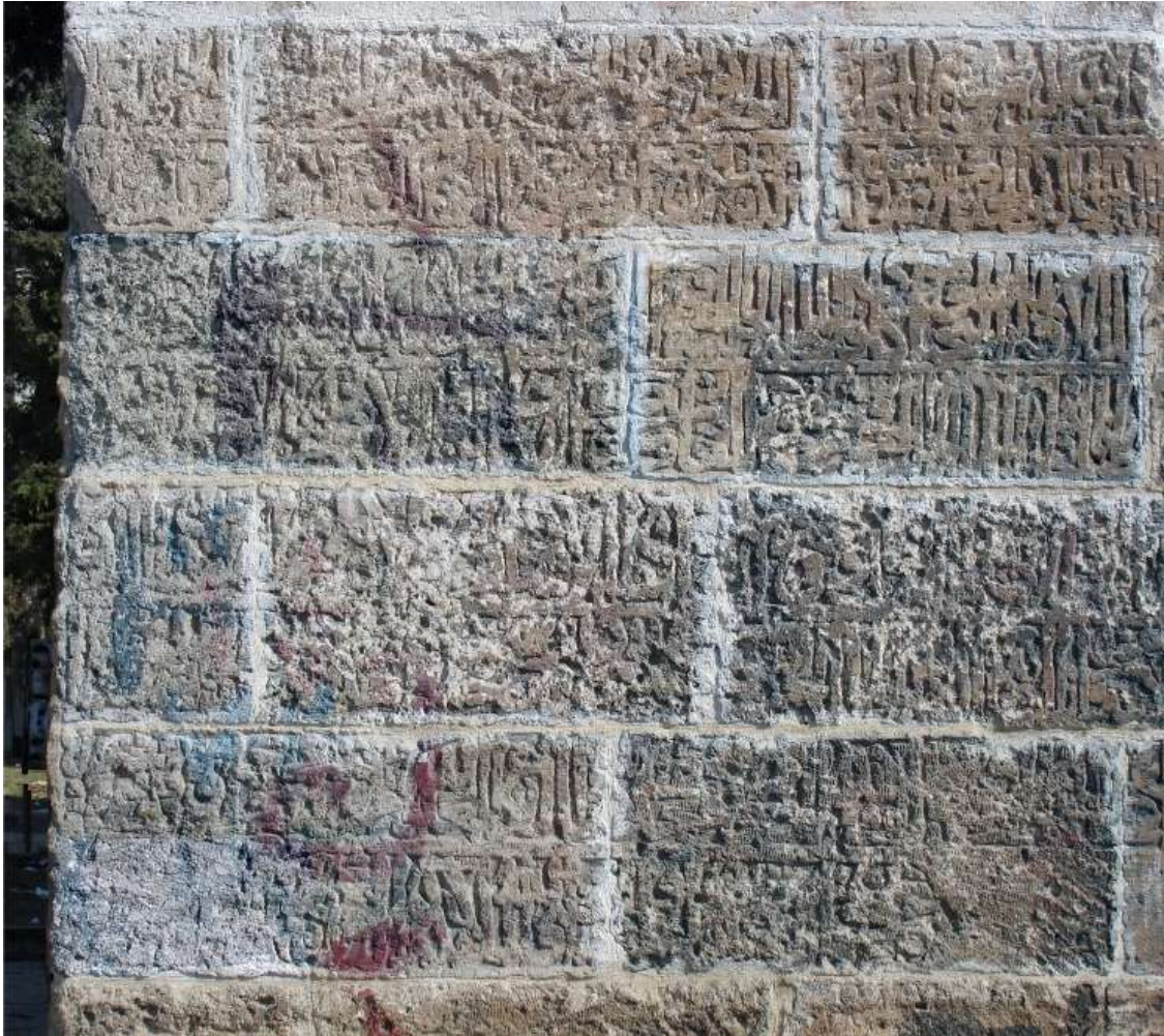
Pl. 3 The author's 2005 photograph of the edict that is currently being studied before the last War