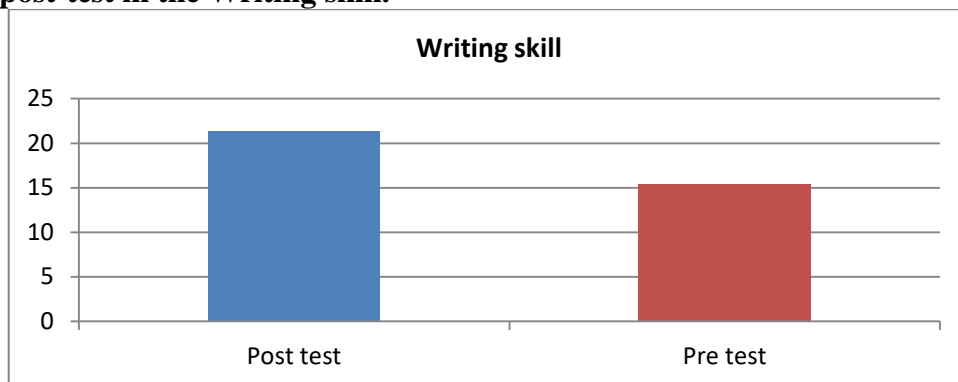
Figure (2) Bar Chart of the Mean Scores of Teachers of the pre and post-test in the Writing skill.

It is clear from the previous graphic representations that there are statistical difference between the scores of pre-test and post-test graphically.